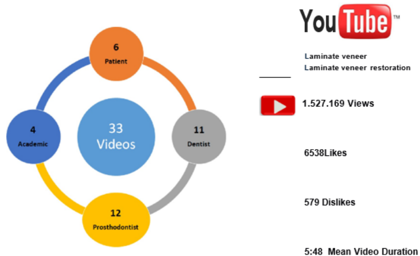
Figure 2 Overview of "Laminate Veneer" Related Videos on Youtube