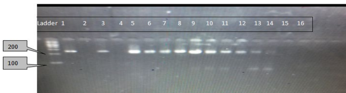
Figure 2: (3%) Agarose gel showing restriction digestion of PCR products. 1,3,5,6,7,8 and 12 are wild-type ;9,10,11,13,and 14 are heterozygous ; 15 and 16 are negative controls .