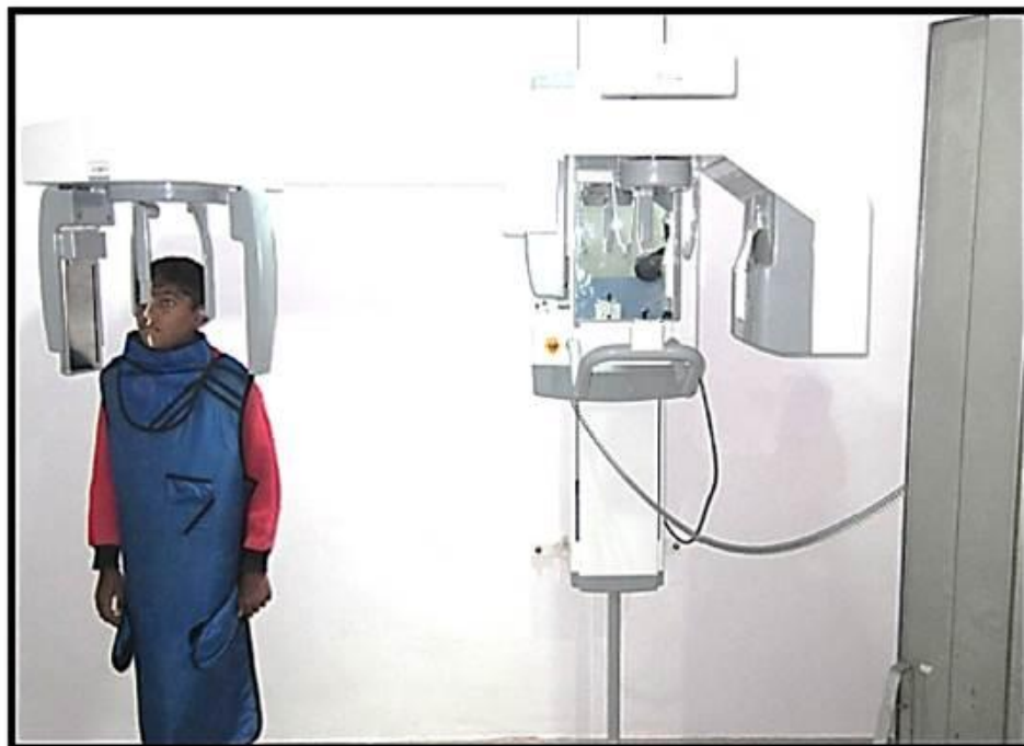
Figure 4: Photograph of subject while taking lateral cephalometric radiograph