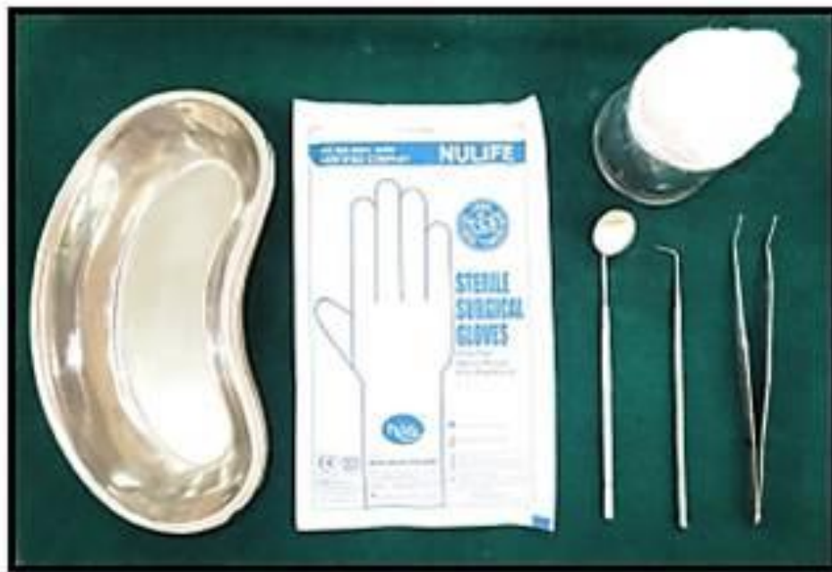
Figure 1: Diagnostic Armamentarium