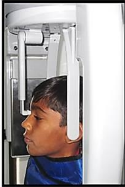
Figure 3b: Profile view of subject positioned in cephalostat