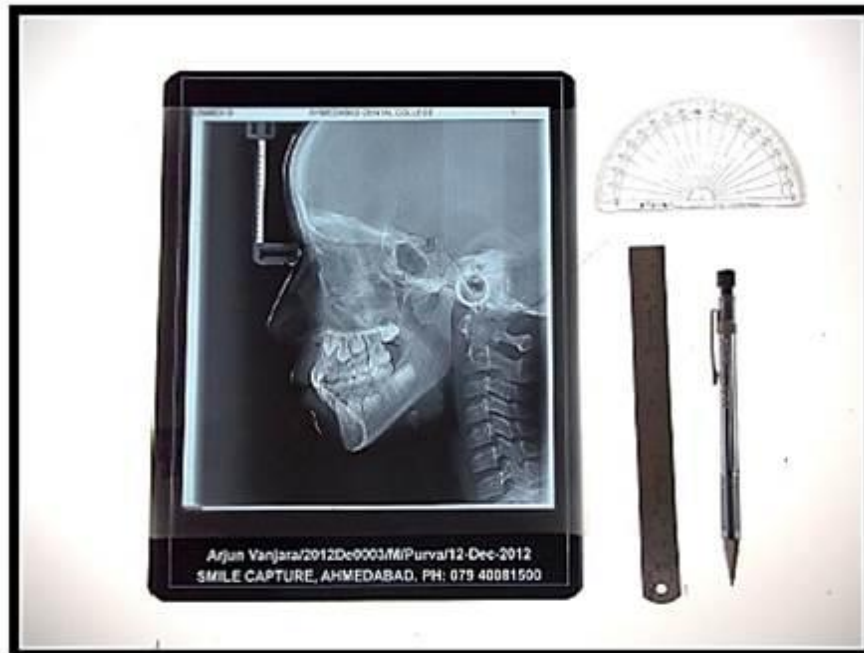
Figure 5: Tracing armamentarium with traced cephalometric radiograph