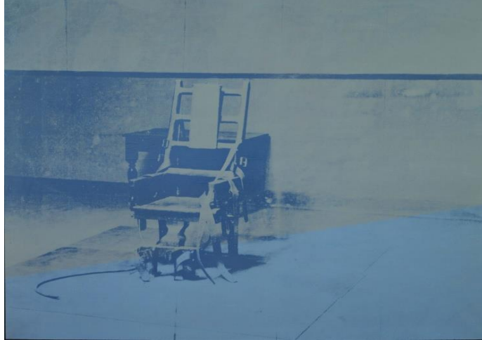
Andy Warhol (1928-1987)

Big Electric Chair 1967-1968 (acrylic and silk screen ink on Lenin)