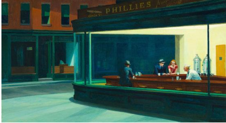
Edward Hopper (1882-1967)