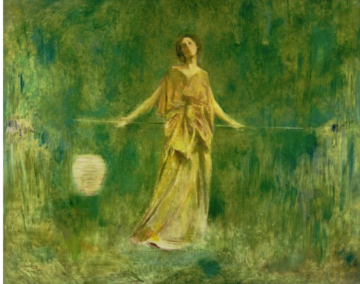
Thomas Wilmer Dewing (1851 - 1938)

Symphony in Green and Gold 1912 Oil on panel