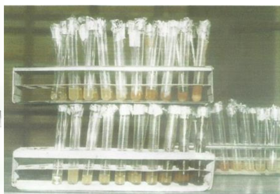
Figure 2: MIC Determination

The results of the elemental analysis, phytochemical screening, antimicrobial tests and minimum inhibitory concentrations for the water and ethanolic extracts are presented in Tables 1 to 6.