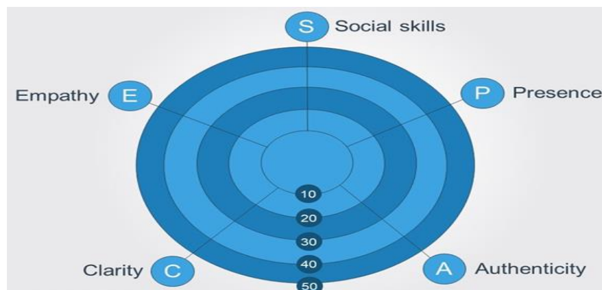
Figure 2: Social intelligence profile [5].

The concept of social intelligence was introduced in 1920 by American psychologist Edward Thorndike., who characterized social intelligence as the ability to accomplish interpersonal tasks. It is the ability to read nonverbal cues or make accurate social inferences. Unlike general intelligence, social intelligence can be developed. Social intelligence increases with academic level and experience of a person.