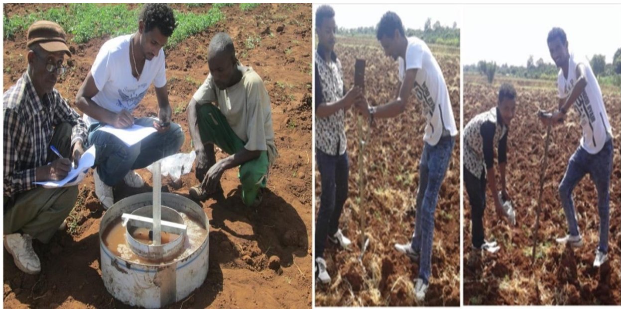
Figure 2: Infiltration Rate Test and Soil Sampling

The basic infiltration rate in this experiment was found to be 4.8 mm/hr which is in the lower range of clay soil (1-5mm/hr) (Hillel, 2004). This means that a water layer of 4.8 mm on the soil surface will take one hour to infiltrate. In dry soil, water infiltrates rapidly and as more water replaces the air in the pores, the water from the soil surface infiltrates more slowly and eventually reaches a basic infiltration rate.