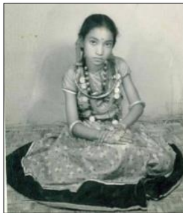
Figure 1(g): Bara and Hasuli (Hand and neck)