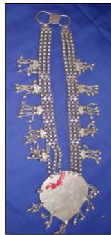
Figure 1(c): Pooj (neck)