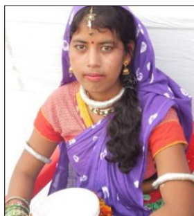
Figure 1(h): Bank