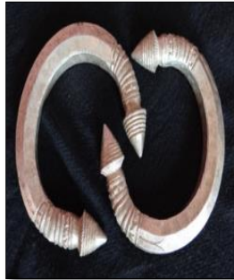
Figure 1(f): Khaduva (hand)