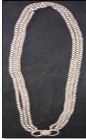
Figure 1(e): Sakai (neck)