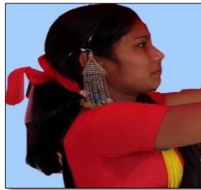
Figure 1(b): Karputiya (ear)