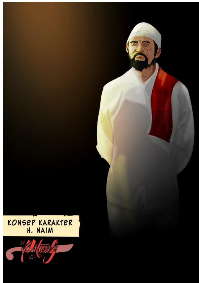
Figure 3.5: character of H Naim Illustration by Nico Sandjaya

The characters of the old-time betawi heroes are identical to brightly colored clothes like red and green. The Betawi people tend to be diligent and obedient to their religion. Therefore, usually every day they want to travel, they always carry a sarong, to run the activities of prayer. In addition, their pants using \frac{3}{4} size is intended so that their pants are not dirty which will result in the unauthorized conduct of their prayers. For the character of the body and face of the Pitung, a sturdy body with whiskers and whiskers. A typical Betawi cloth wears a black cap, a large green belt then added with a dagger for self-defense if it is an emergency.