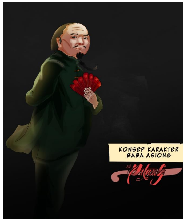
Figure 3.6: character of Baba Asiong

Baba Asiong is a good Chinese descendant in business portrayed with an antagonist character he is a landlord who likes to rent and buy citizens' land using terror threats if the inhabitants do not provide very cheap prices on sale at very expensive prices. To smooth his evil plans, Baba Asiong has employed many champions from his own land of betawi to become cement-centered cuds to the poor. Baba Asiong is the enemy of Si Pitung because of his very greedy nature illustrated with a flat face with a ruthless stare then with a fan in the hands of cursing red,