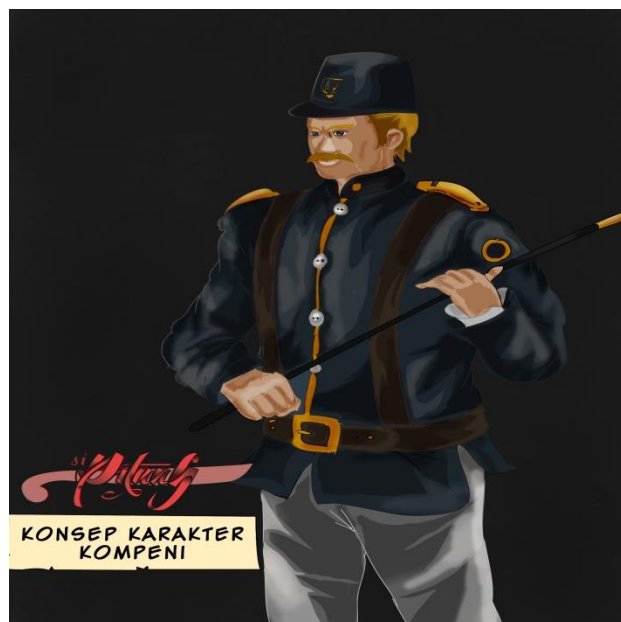
Figure 3.7: character of Kompeni

Baba Asiong is a good Chinese descendant in business portrayed with an antagonist character he is a landlord who likes to rent and buy citizens' land using terror threats if the inhabitants do not provide very cheap prices on sale at very expensive prices. To smooth his evil plans, Baba Asiong has employed many champions from his own land of betawi to become cement-centered cuds to the poor. Baba Asiong is the enemy of Si Pitung because of his very greedy nature illustrated with a flat face with a ruthless stare then with a fan in the hands of cursing red,