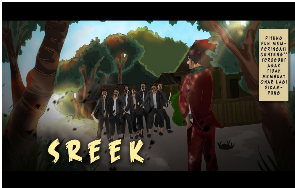
Figure 3.2: Rescue Si Pitung fight with a mask Illustration by Nico Sandjaya

Illustrations in the illustrations can be seen clearly the character of the Pitung as a champion or whiz with just memperlihatkan fist picture so sturdy that drawings that Si Pitung is a knight always defend the society cannot afford. Detailed hand drawings and then mimic the character of the villain has a very perfect whiz.