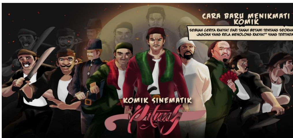
Figure 3.8: character Dutch port Illustration by Nico Sandjaya

The other antagonists are the centengs. Actually the centeng-centeng is a champion-martial arts master with great ability. The jawara were usually hired at high prices by the landlords or by the Dutch government. The inhabitants also believe that the champions possess immune sciences and so on, so it is feared by the inhabitants. They are identical with black-colored outfits, with ghostly looks, even bias and expert and use sharp weapons like machetes, axes.