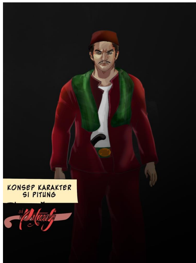
Figure 3.5: character of the Pitung Illustration by Nico Sandjaya

The logo of the pitung in this digital comic focuses comic concept focused on the age of the students, whose purpose is to invite the students to watch the comics made by the children of their own country. On the basis of the segmentation, the author makes a slightly interesting logotype. The font is designed like handwriting and red colored. The red color here symbolized by one of the bold Pitung's character, red font and color is also designed to get the impression of exclusive and elegant because it is shown for the age of over 15 years. To add to the masculine impression of the figure of Pitung.