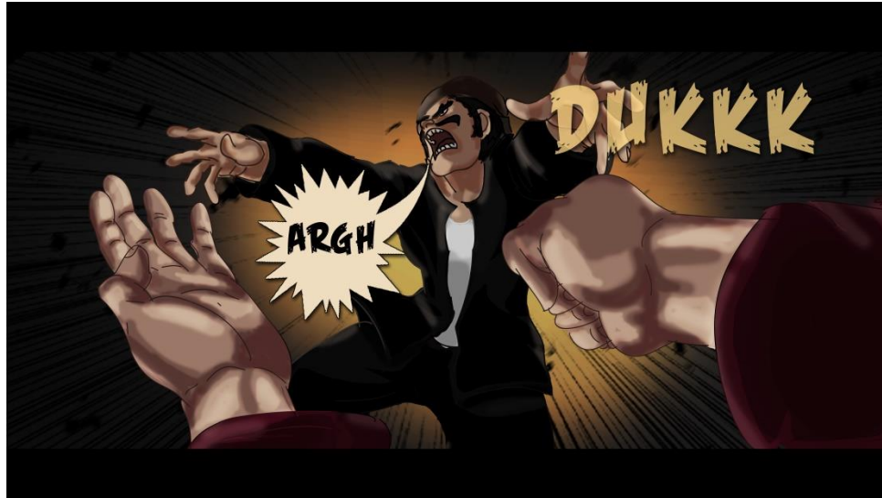
Figure 3.2: Rescue Si Pitung fight with a mask Illustration by Nico Sandjaya

Illustrations in the illustrations can be seen clearly the character of the Pitung as a champion or whiz with just memperlihatkan fist picture so sturdy that drawings that Si Pitung is a knight always defend the society cannot afford. Detailed hand drawings and then mimic the character of the villain has a very perfect whiz.