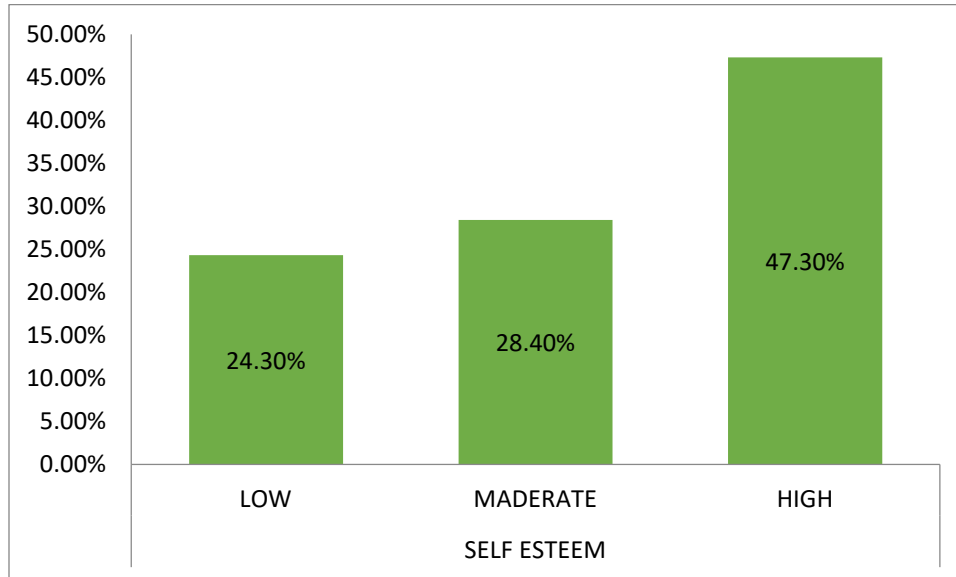
Chart 1: Difference in the Level of Self Esteem among the Selected Higher Secondary Students.

According to the table totally 25.66% of higher secondary student belong to low level of self esteem, 42.33% of higher secondary students belong to moderate level of self esteem, 32% of higher secondary students belong to high level of self esteem. So the hypothesis No: 1 is accepted. Thus it is inferred that there is a difference in the level of self esteem among the selected higher secondary students.