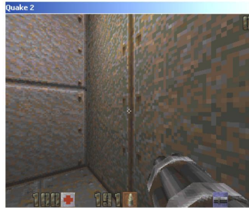
Figure 2: Agent wall following