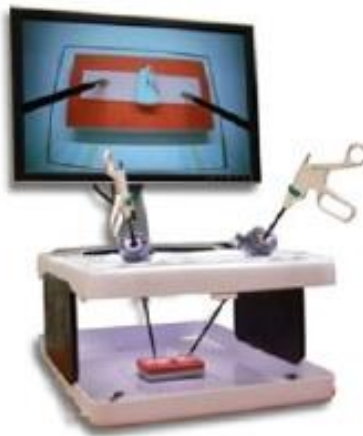
Figure 1: FLS Box Trainer by FLS 42 and VTI Medical

A program of the society of America Gastrointestinal and Endoscopic Surgeons (SAGES) and the American College of Surgeon (ACS). 41 Image see below.