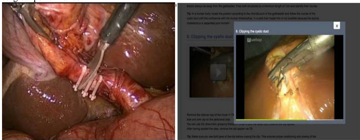
Figure 2: Screenshot of a WeBsurgery 12 high-definition video – Web-based training Video (WBTV) Model

Web-based simulation allows learners to interact with online curricula, exercising the cognitive aspects of surgery (e.g., what are the steps of a gallbladder removal, what surgical instruments are needed). Internet platforms providing surgical content have been established. Used as a surgical training method, the effect of multimedia-based training on practical surgical skills has not yet been evaluated. This study aimed to evaluate the effect of multimedia-based training on surgical performance. 8