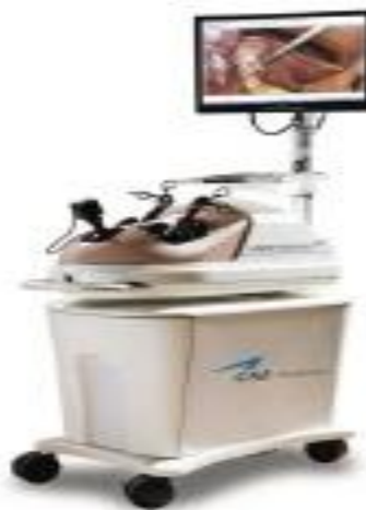
Figure 3: CAE Laparoscopy VR surgical simulator

The most technologically sophisticated class of simulator is the VR simulator, which features a computer-generated model of anatomy and requires that learner use near similar instrumentation to interact with virtual tissue structures and models