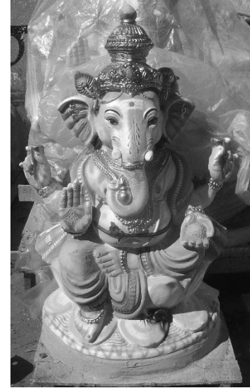
Figure 1: Gaṇapati

Human beings at the time of birth weights anywhere between 2.5 kg to 4 kg. As they grow, normally adults reach between 50 kg to 100kg, or even more. This add-on of the weight is mainly due to the food we eat. Thus we can comfortably attribute the physical body ( annāmaya kośa ) to the food; and thus can also be comfortably attributed to the basic causing factor ( kāraka ) of annāmaya kośa . Fig. 1 shows a typical Gaṇapati.