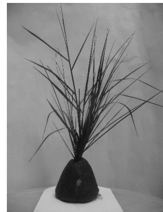
Figure 4: Pillari

Pillari: Added to the above coincidences is the Pillari which further supports the hypothesis that Gaṇapati is lord of food. The Pillari is said to be the true original or root form of Gaṇapati. During the Gaṇapati festival on Bādrapada cauti (4 th day from the new moon day), before doing pūjā for the elephant faced form of Gaṇapati, the ' Pillari ' is first offered the pūjā . Pillari is basically cow dung in the shape of a cone with a little grass pierced into the apex of the cone. Grass indicates the vegetation, which is the source of food. Grass family is the family of vegetation where we get the basic/staple food,