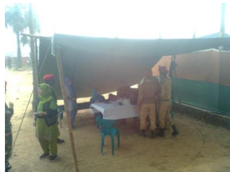
Plate 8. Medical camp