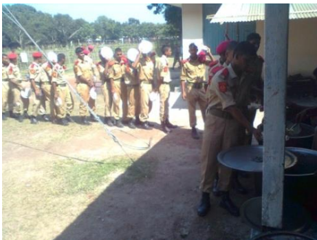
Plate 5: Waiting for food