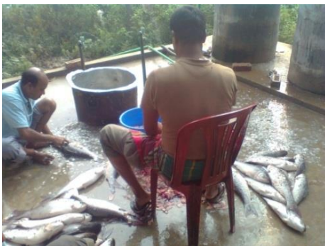
Plate 7: Raw fishes with blood