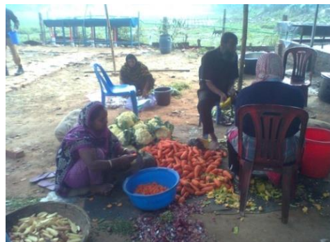
Plate 6: Need more conscious in open area