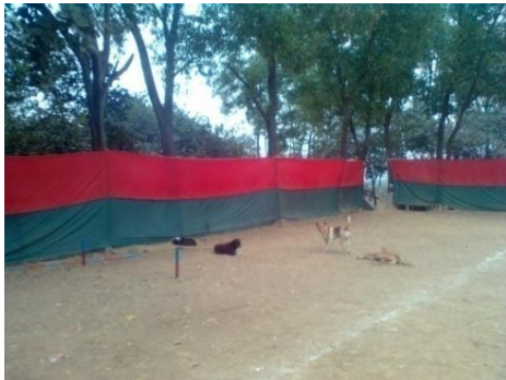
Plate 3: Animals are vector