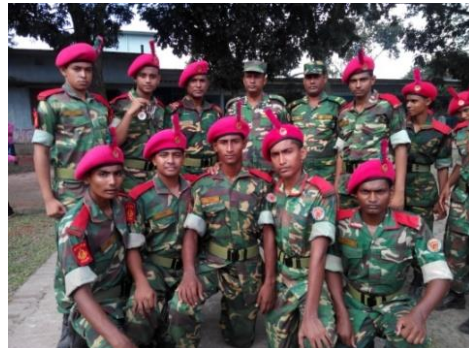
Plate 4: Adjutant and PUO (writer)