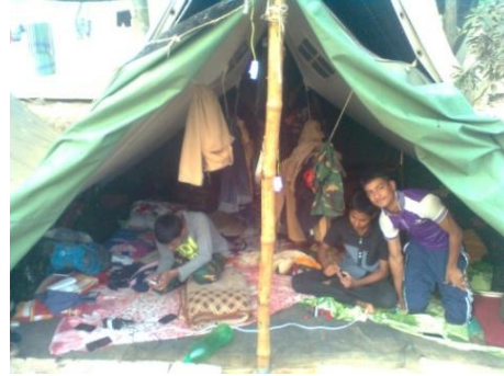
Plate 2: Physical contact may fatal