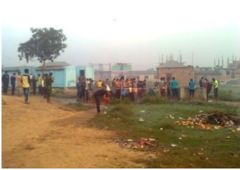
Plate 1: Morning shows the day