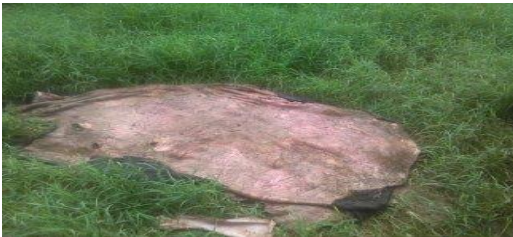
Figure 2: Ground air drying method in Lare Woreda

The distribution of hide and skin preservation methods in the study areas by respondents in all methods type is not on the same stage which was presented in table 5. The findings revealed that in all of the study area of hide and skins preservation methods higher variation was assessed. On the other hand, elongation capacity was within the standard range interviewer understanding for preservation of hide and skins to keep its quality.