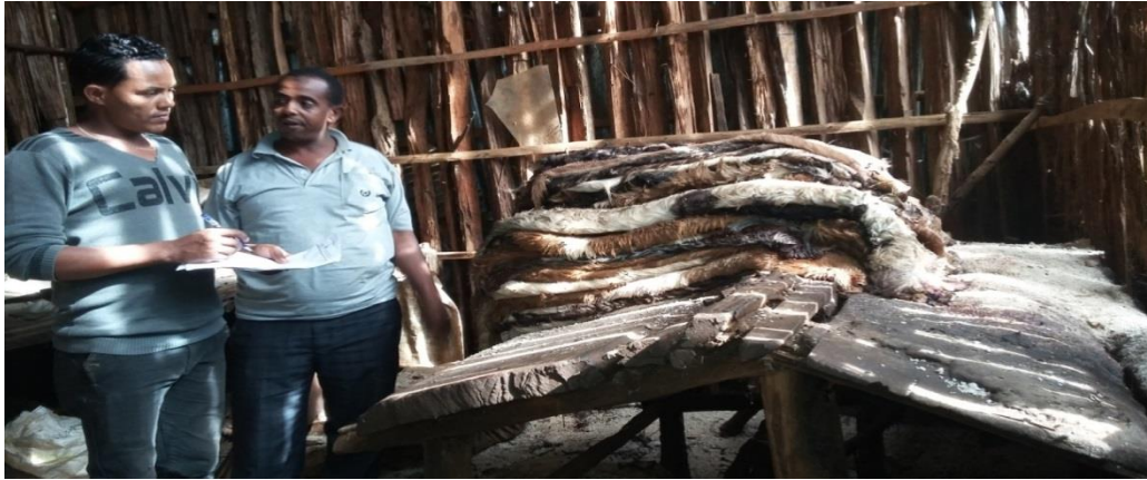
Figure 3: Preservation method and storage of sheep skin in Godare woreda skin storage place