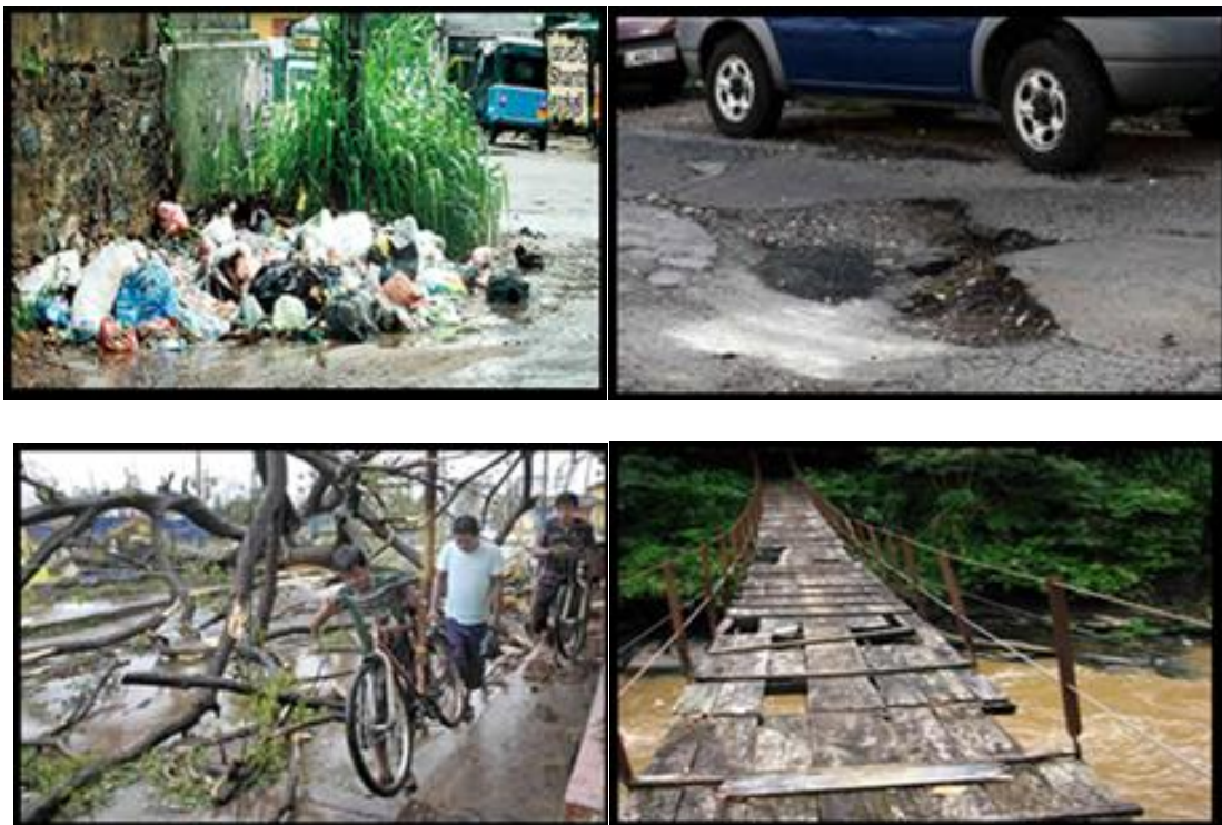
Figure 1: Physical Civic Issues

Figure 1 shows some physical civic issues prevailing in the country.