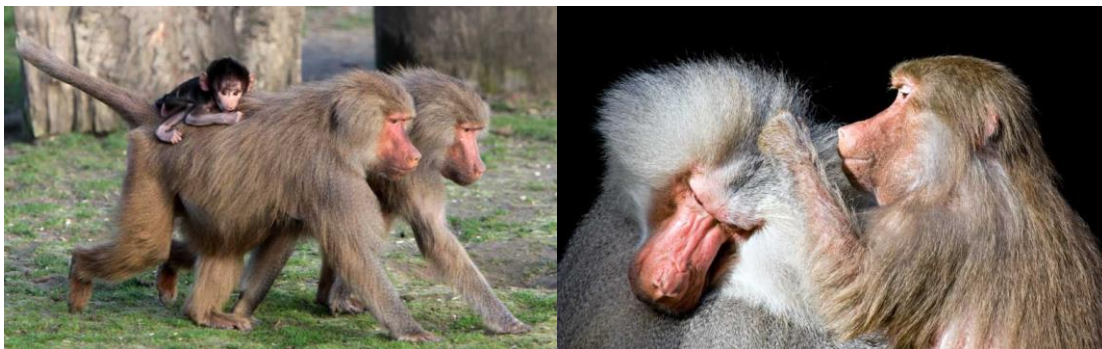
Figure 1: Baboon in forest