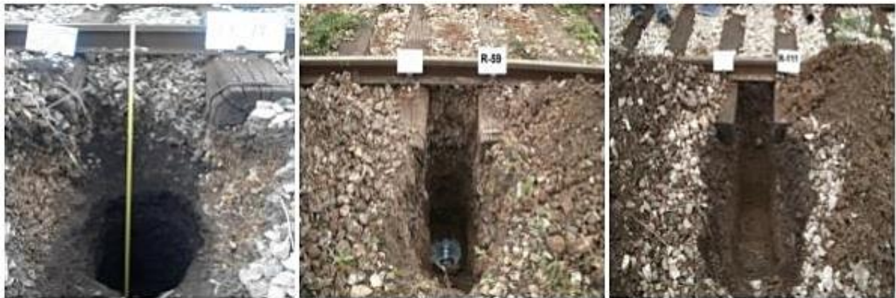
Figure 2: Characteristic trial pits along the research section of the railway route, corridor V.

Materials that build an embankment along the vertical, ie superstructure and foundation of the railway, were established in exploratory trial pits, figure 2, and have characteristics given in the table 2 [5,6,7,8].