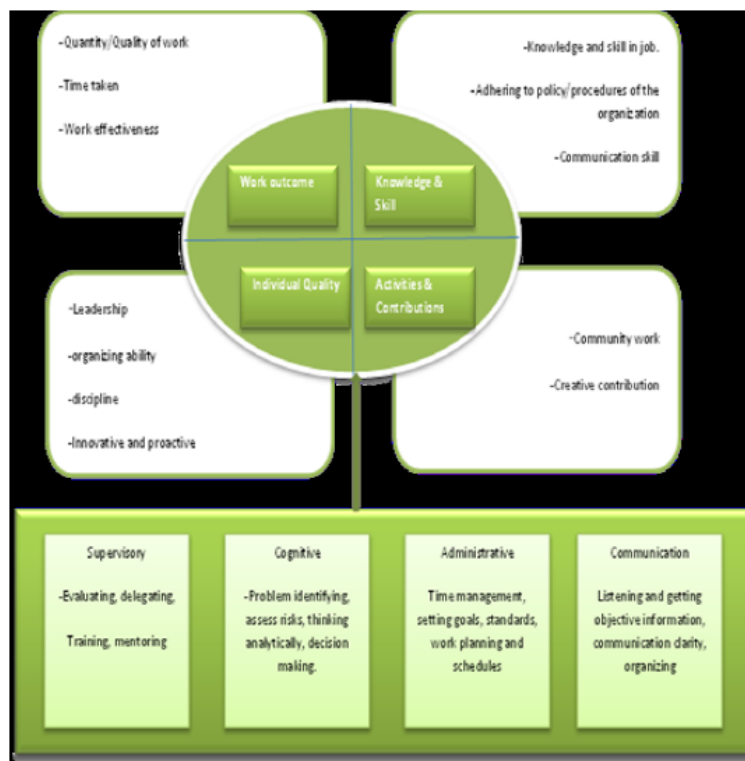
Human Talent predictions using DM techniques [9]

The advancement in technology has led to many changes in working of HR professionals. HR professionals can now devote more time in making strategic decisions for the firm. Due to this advancement in technology the HR professionals are not required to do work manually. This data is considered to be the best in making decisions swift and easy. But the problem here is, to find the useful data from a huge amount of data. This is when the significance of data mining comes into the picture. Here the data, information and knowledge can be used interchangeably. In Human Resource Information systems Data Mining is considered to be the best tool for knowledge management. When data mining first appeared in 90’s it was used for clustering, classifying and predicting the data for efficient decision making. But this is the time when data mining and knowledge discovery are used interchangeably. When we talk about data mining with respect to HRIS it is considered that its exact purpose goes beyond when it touches the stage of knowledge discovery. It plays an important role in compensation and employee retention.