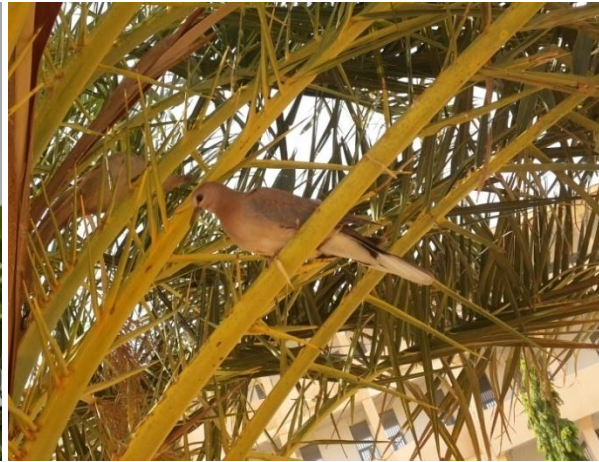
Figure 2: Laughing Dove, Streptopelia senegalensis