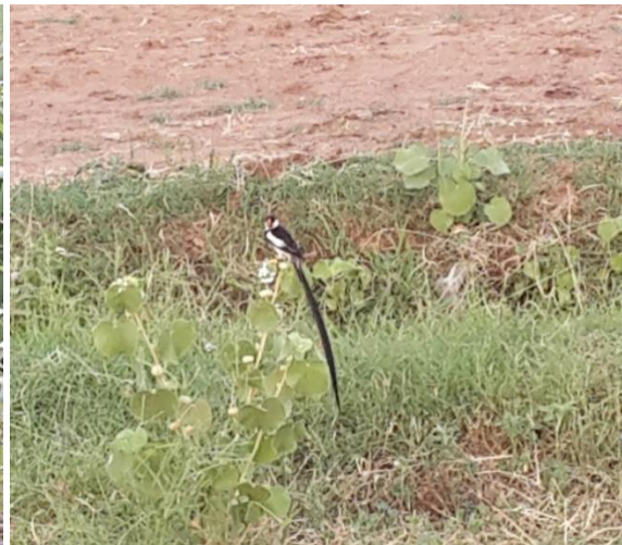
Figure 10: Pin-tailed Whydah, Vidua macroura