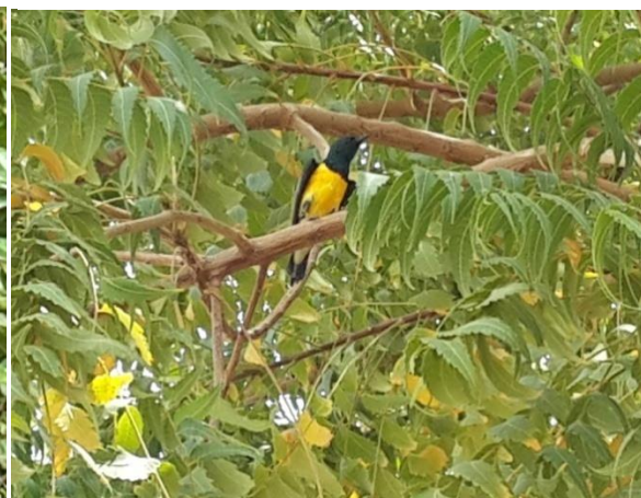
Figure 6: Nile Valley Sunbird, Hedydipna metallica