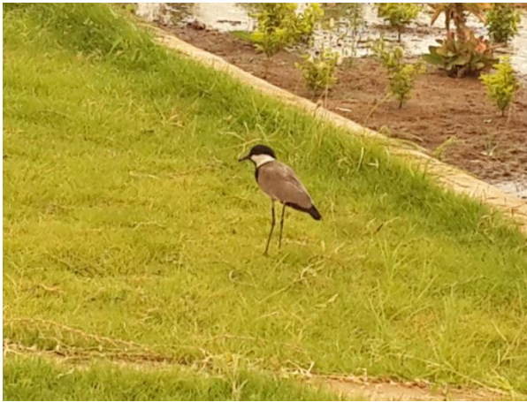
Figure 15: Spur-winged lapwing, Vanellus spinosus