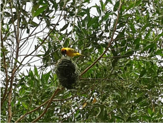
Figure 7: Village Weaver, Ploceus cucullatus