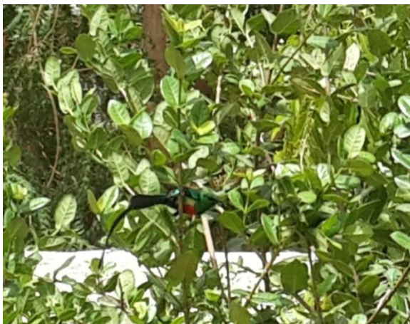
Figure 5: Beautiful Sunbird, Cinnyris pulchellus