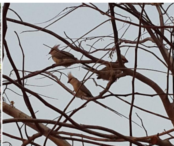
Figure 12: Blue-naped Mousebird, Urocolius macrourus