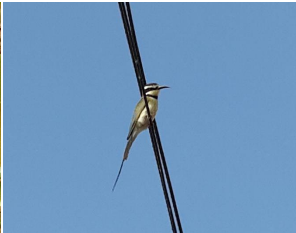
Figure 4: White-throated Bee-eater, Merops albicollis