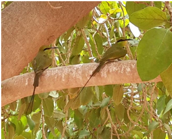
Figure 3: Little Green Bee-eater, Merops orientalis