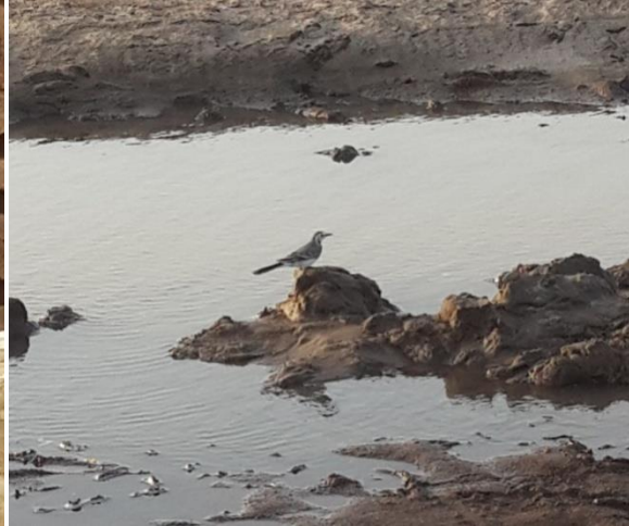
Figure 14: African Pied Wagtail, Motacilla aguimp