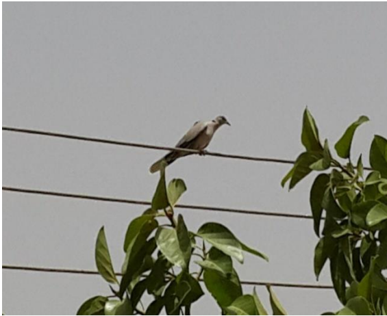
Figure 1: African Collared Dove, Streptopelia roseogrisea