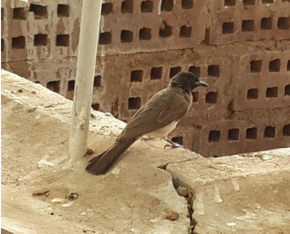
Figure 13: Common Bulbul, Pycnonotus barbatus