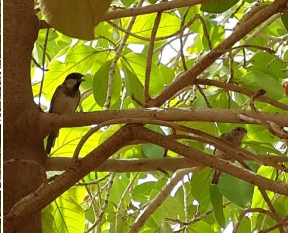
Figure 8: House Sparrow, Passer domesticus