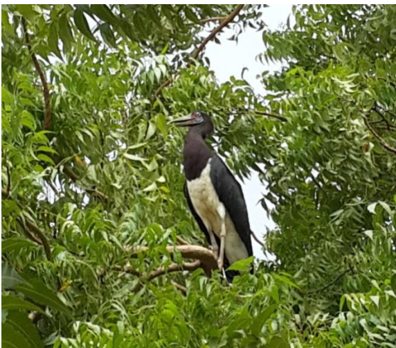
Figure 17: Abdim's Stork, Ciconia abdimii