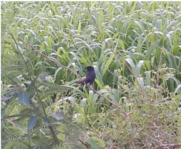
Figure 9: Black Scrub-robin, Cercotrichas podobe