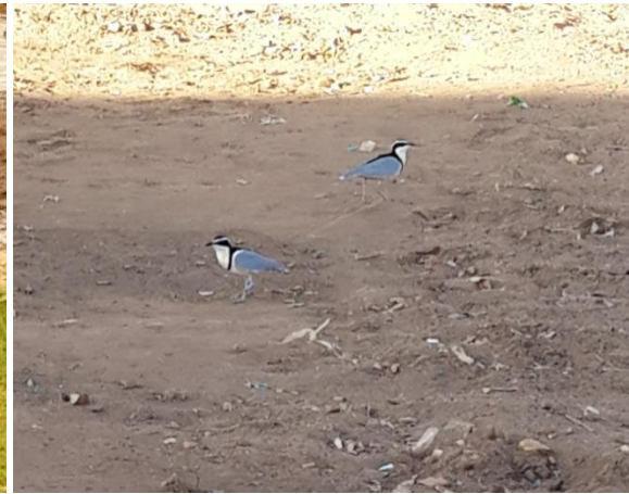
Figure 16: Egyptian Plover, Pluvianus aegyptius