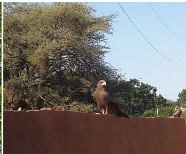
Figure 18: Black Kite, Milvus migrans