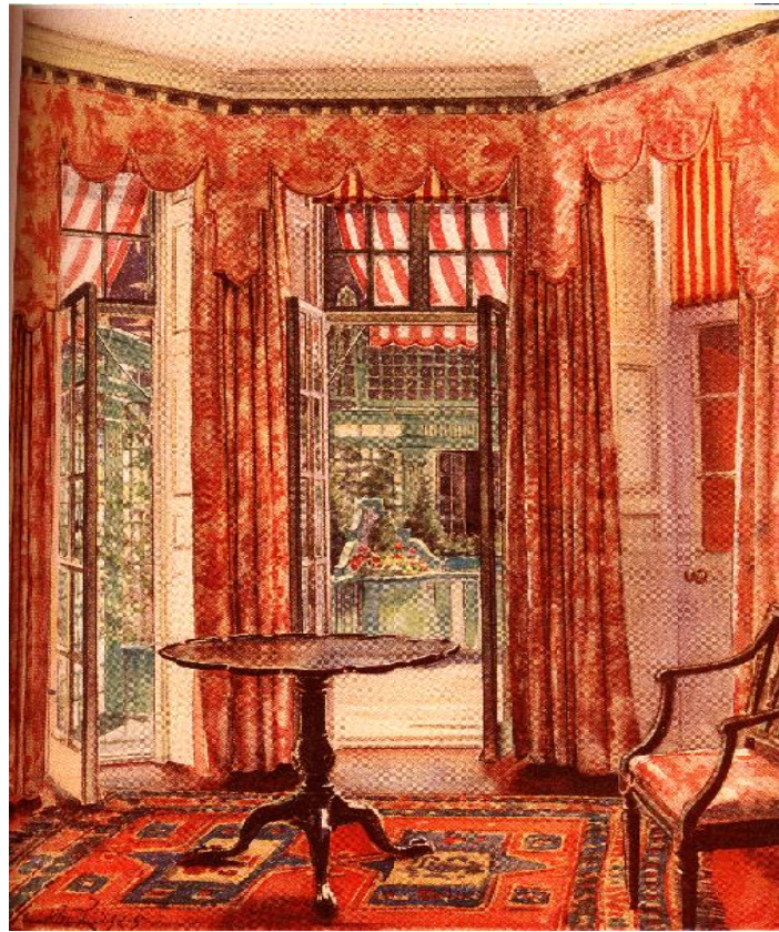
Fig.7 A room in varied tones of red. Picture by W.B.E. Ranken.

Originally from the book 'Colour and Interior Decoration' by Basil Ionides. Pub: Country Life Ltd., London, 1926.