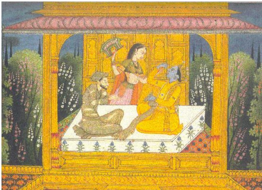
Fig.6 A golden yellow interior in a traditional miniature painting, Garhwal, Pahari.

Yellow, sunshine, gaiety – all these go together, but yellow must be bright for the purpose. At times, it is used to symbolize divinity, amazement and wonder in Indian art. If not bright, yellow loses its shiny and gaiety effect. It is a most useful colour for northern aspects and for dark places. A light room facing north may be pale yellow and delicate, but as the room becomes darker, so should the yellow become more orange and brilliant. A strong orange is not pleasant in a very light interior.