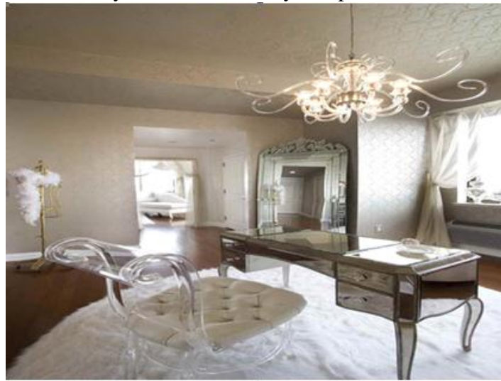
Fig.1 A complete white interior with various shades and materials of white.

The tranquility and piousness conveyed by white is responsible for its universally accepted association with peace and with Shāntam rasa in Indian Art. White can be so liberally used in an interior and can be so pleasing even if everything in the interior is planned in white. The old saying that white decoration is the last resort of people with no taste can no longer be accepted as true, since a better sense of values has opened up new fields for the use of modern paints, enamels and distempers, with which an infinite variety of surface and tone can be achieved. The wide variety of materials available nowadays makes a white interior more vibrant and doesn't allow a white interior to be monotonous. For instance, use of crystal or white leather in accessories of a white interior only adds to the beauty and pristine look of a room.