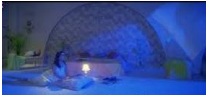
Fig.3 A blue room complimented by use of right light arrangement.