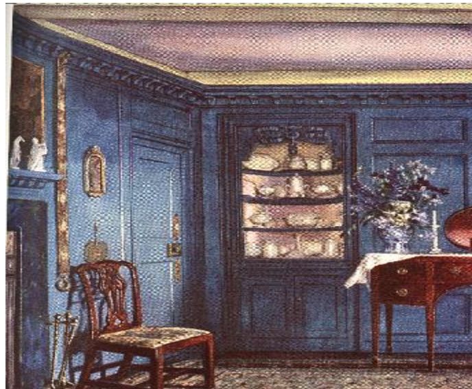
Fig.2 A room with stippled blue walls. Picture by W.B.E. Ranken. Originally from the book 'Colour and Interior Decoration' by Basil Ionides. Pub: Country Life Ltd., London, 1926.