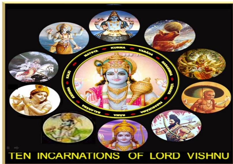
Figure 2 Ten Incarnations of Lord Vishnu