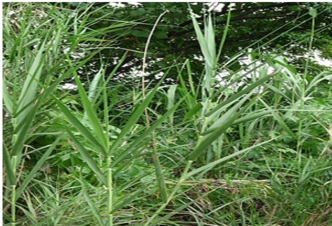
Figure 4 Reed grass (Phragmites karka)