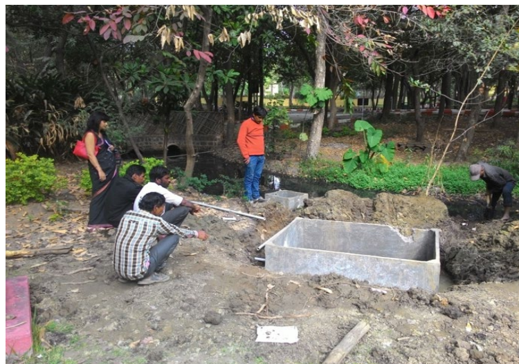
Figure 1 construction of wetland