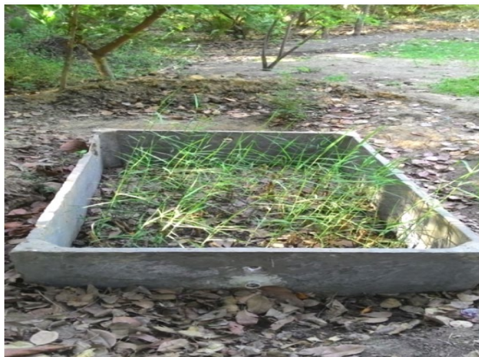
Figure 2 Plantation of reed grass in wetland