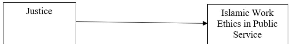
Figure 1 Conceptual Framework

Islam completely rejects injustice in public service such as favouritism and cronyism in hiring and firing of employees, fraud, monopoly, exploitation and at the same time encourages prosperity through the proper use of Allah's resources provided for mankind Muhammad et al. (2012) . Among the duties of any person entrusted with a leadership position is to oversee the affairs of his domain, to apply the religious teachings among his people, to establish justice throughout his realm and to provide for the needs of his people Mujahid (2012) . According to Sultan Muhammad Bello of the Sokoto Caliphate, any person given a trial of leadership in the public service should strive to play it safely since he is going to give the account of his leadership that comprises his actions, words and affairs before Allah (SWT) Yusuf (2013)