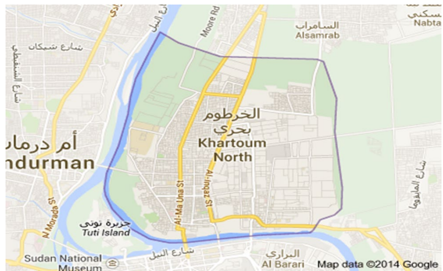
Figure 1 Bahri - locality, Khartoum north, Khartoum, Sudan

This study was carried out in August 2016 at Bahri - locality, Khartoum state in order to evaluate food hygiene Knowledge, Attitudes, and Practices of consumers towards food safety. A total number of 120 respondents were selected randomly from different areas of Bahri -locality.