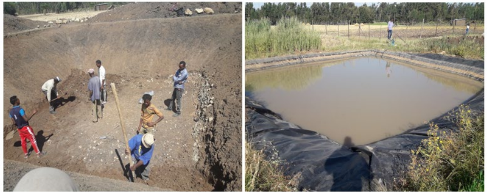
Fig 2 Water harvester pond constructed