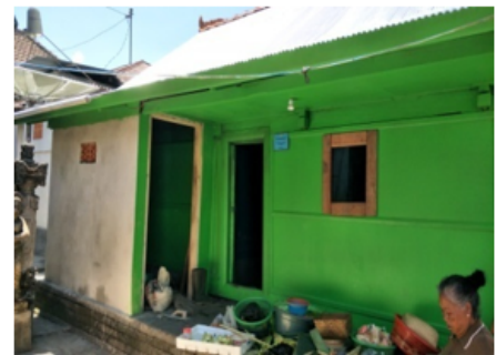
Conditions after receiving assistance