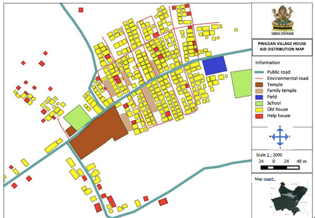
Figure 5 Distribution of traditional housing and government assistance

In the southern part of the village, it is possible to form new settlements because previously there were already resident settlements in the southern part of the village, plus the construction of government housing assistance. However, for access to the southern part of the village there is only a path that can only be passed by motor-bikes. Settlement is an environment where humans live which consists of a group of houses with various kinds of social facilities, public facilities, movement networks, and facilities and infrastructure. The settlement environment is a residential area in various shapes and sizes with land and space arrangements, structured environmental infrastructure (Nuraini, 2009).