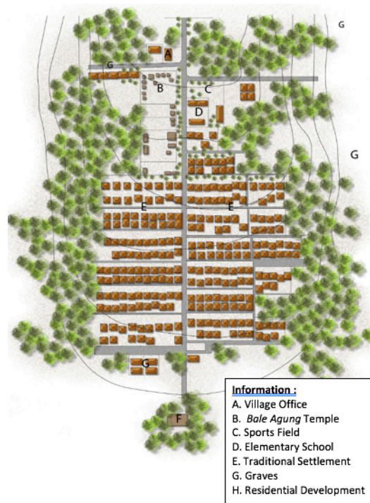
Figure 2 Spatial Map of Pinggan Village