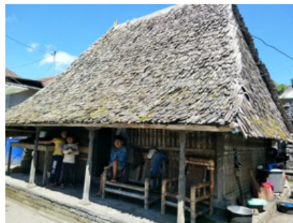
Conditions Before receiving assistance