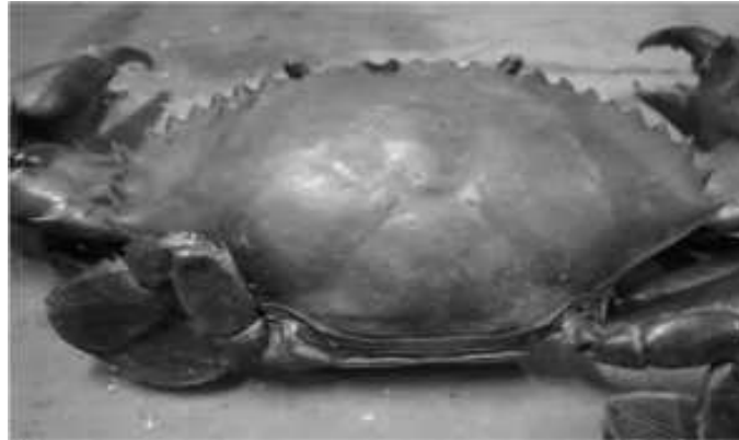
Figure 3: Measurement method; carapace width (1) and carapace length (2) of Scylla serrate

Determination of mangrove crab sexual is done by observing the shape of abdomen. The abdominal segment of male crab is tapered, while the female is wider. Female abdomen like stupa while male like pillar.