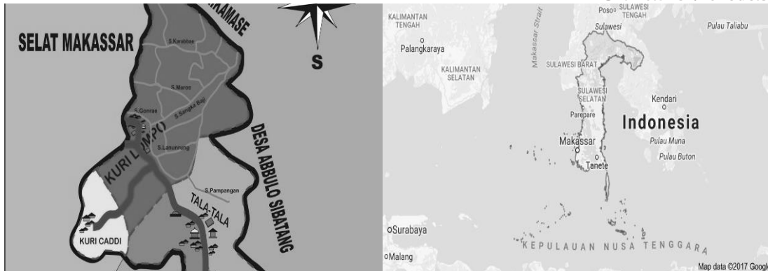
Figure 1: Map of Kuri Lompo in Makassar Strait