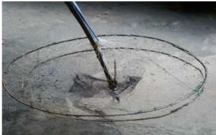
Figure 2. Fishing gear bubu

The tools used in this research were fishing gear bubu serves to catches crabs, plastic bags for storing sample, preparatory boards for placing samples, sliding compass for measuring carapace width of crabs, digital scale 0.001 g to measure sample weights, and a camera for documentation. The sample used in this research is mangrove crab ( Scylla serrata ).