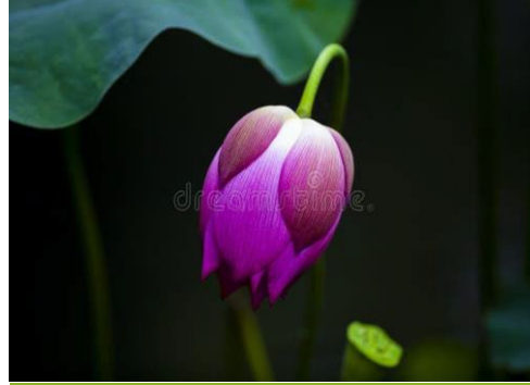
Figure 2 Inverted Lotus bud

Its shape is Adhomukha- Pundrika, or a downward-facing lotus. Trikamji et al. (2009) . It is connected to ten Mahadhamani, or throbbing vessels, which supply the entire body with blood, nutrients, and oxygen as well as vital substances. The disagreement girding the cranial and thoracic hearts is thus ultimately cleared up by the references mentioned over. As a result, it may be said that the constitution, physiology, and functionality of the Urastha Hridaya are analogous to those of the heart.