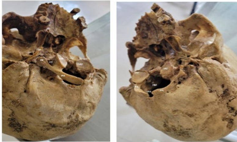
Figure 2 Lateral Views of Skull