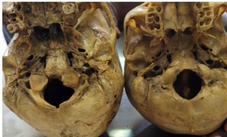
Figure 3 Comparison with Normal Skull