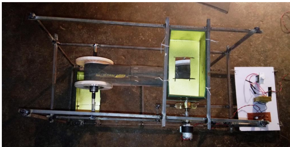
Figure 1: Experimental setup

The flat belt consists of more layers of material to provide the linear strength and shape, the materials flowing over the moving flat belt with speed. Belt conveyer technology was also used in conveyor transport system such as many manufacturing assembly lines. Belt conveyors were the most commonly used in power conveyors because of they are the most versatile and the least expensive. These conveyors system used the highest quality premium belting products, which reduces the belt stretch and results in less maintenance by tension adjustments.