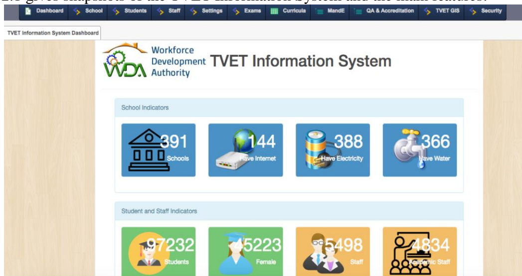
Figure 2.1: Snapshot of Dashboard

Figure 2.1 gives snapshots of the TVET Information System and the main features.