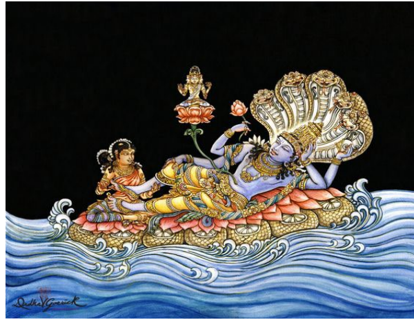
Figure 4 A colourful painting of Goddess Lakshmi and Lord Vishnu shows Lakshmi holding the feet of Vishnu on her lap in a manner of reverence.