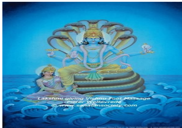
Figure 3 This portrayal shows Goddess Lakshmi holding one foot of Vishnu on her lap.