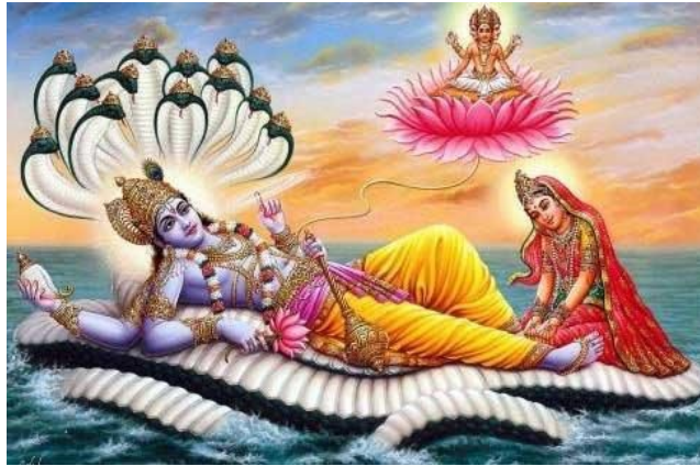
Figure 1 This is a popular calendar image of Lakshmi sitting at the feet of Narayana, an incarnation of Lord Vishnu, and pressing them for his comfort. Lord Vishnu is one of the principal deities of Hinduism and has other names like Narayana or Hari.