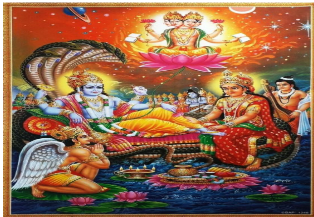
Figure 2 This calendar image shows Goddess Lakshmi sitting at Narayana's (an incarnation of God Vishnu) feet.