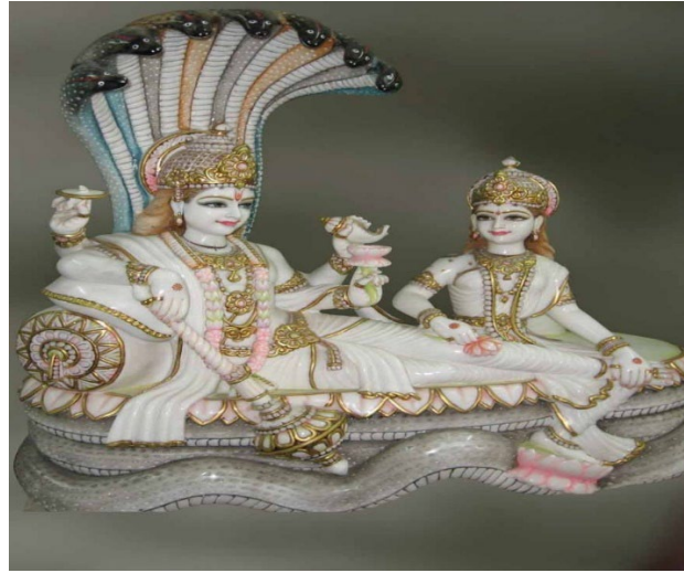
Figure 7 This is a sculpture marble statue of Narayana and Lakshmi, largely sold in village fairs, and markets (also online stores).

In the above figures, the ways Goddess Lakshmi is presented clearly show her subservient position. Different examples are presented here in order to demonstrate how single motif is multiplied and popularized throughout ages in various images, portraits, and paintings. Each figure shows the position of Lakshmi below the God Vishnu. A gender hierarchy is maintained in these visual representations by positioning woman at the feet of man. These religious visual images and the mythologies related to them are stored in socio-religious space in a recreation method. The presence of such representation showing the servitude of women determines 'the cultural process' of female subordination in Indian society (Visuvalingam 1996, 293). Goddess Lakshmi pressing the feet of lord Vishnu is taken by the devotees as a way to dedicate oneself not only to the service of her husband but also to the other elder male members in society. Lord Vishnu is represented as lying idly and receiving good care from his wife. So, the obedient or subservient position of the Goddess Lakshmi in visual representations works as a site of discursive backbone to create women's subservient position in domestic space. In a patriarchal social structure, the above images exhibit the idea of man-made religion in which "men impose their ideas on women" by planting in them the notions of a pre-existed patriarchal superstructure (Mukhopadhyay 2020 , 2).