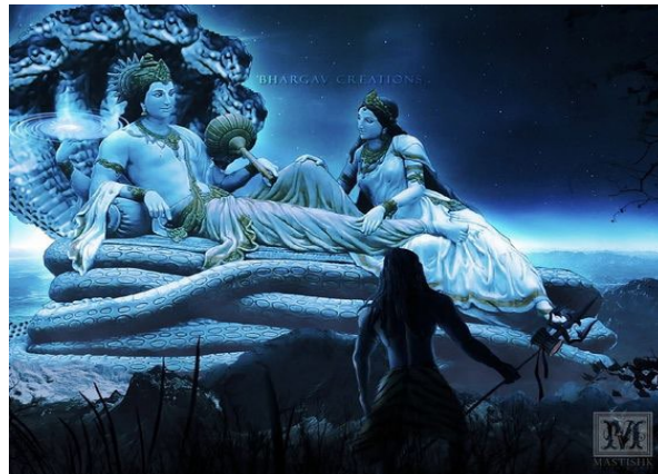
Figure 5 Another popular calendar image shows Goddess Lakshmi touch Vishnu's feet.