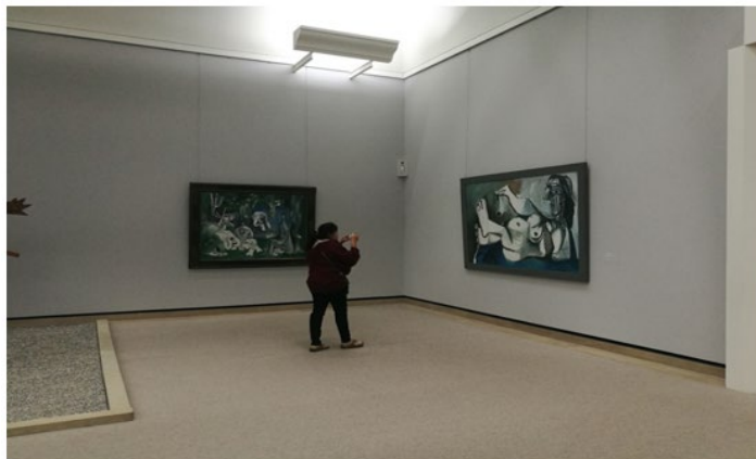
Figure 5 Staatsgalerie Stuttgart, art museum in Stuttgart, Germany