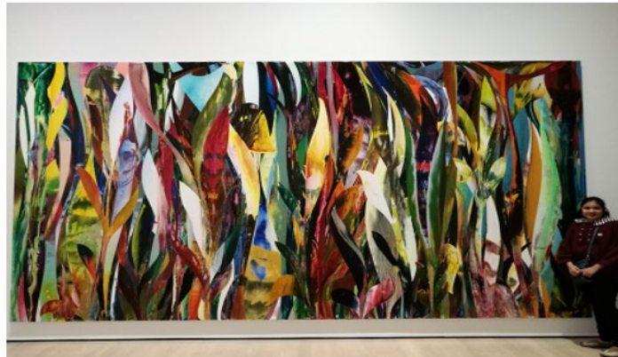
Figure 4 Kunstmuseum Stuttgart is a contemporary and modern art museum in Stuttgart, Germany