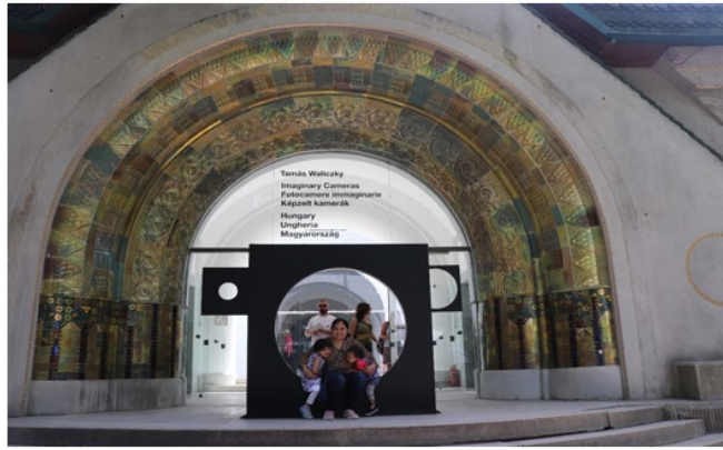
Figure 3 58th Venice Art Biennale 2019 Italy