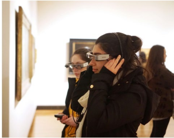
Figure 6 Art Gallery visitors using Art Glass.