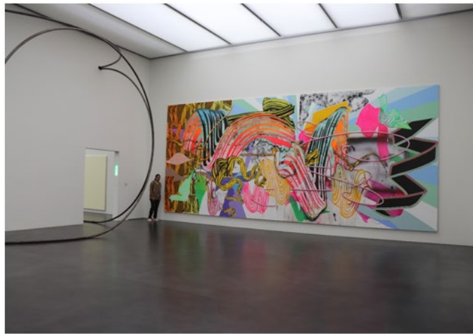
Figure 1 Kunstmuseum Luzern Switzerland

In all these galleries and museums, I got to see very good fusion of technology and culture, that is, we should also explore new techniques through science, by connecting with our Indian culture and discovering new dimensions of art so that our Indian culture is always remain immortal and we will be able to make the future generations aware of Indian culture, because an artist can make technology through art and culture by presenting it to the younger generation with new enthusiasm and can also preserve it. Through this fusion, we will be able to introduce our culture to the next generation in a new way, which will also be exciting for them.