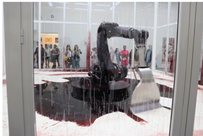
Figure 2 Sun yuan and Peng yu "Can't help myself" robot venice art biennale 2019