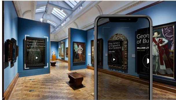
Figure 7 Gallery View of Room 4. "Early Stuart Britain." at The National Portrait Gallery, London, with the Smartify App and its AR technology.