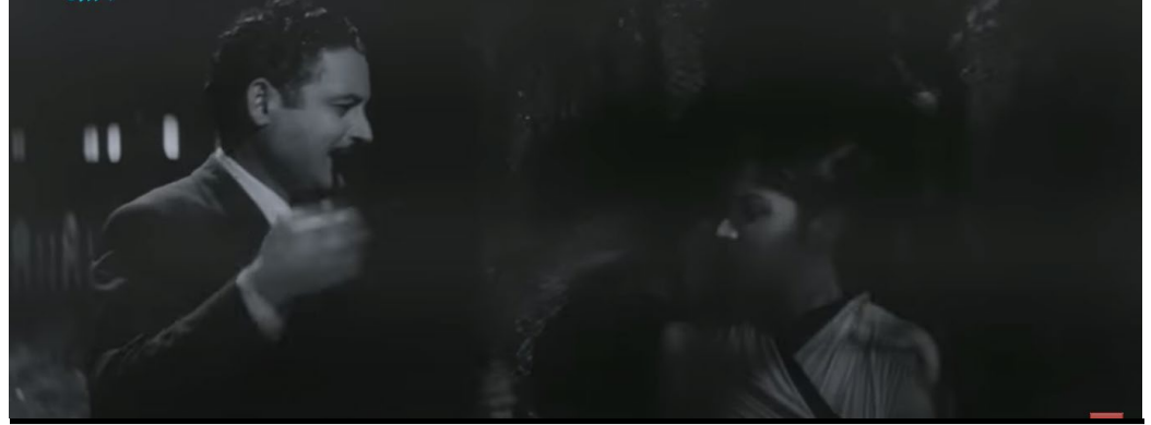
Figure 3 Guru Dutt as Suresh and Waheeda Rehman as Shanti Caught in the Rain in 'Kaagaz Ke Phool'

Source Picture Captured While Actively Viewing the Film.