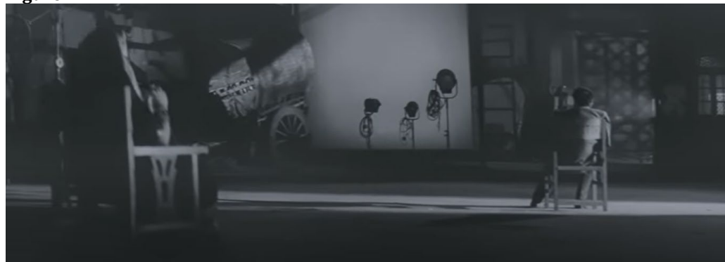
Figure 7 Still from the Film Studio Set within 'Kaagaz Ke Phool,' Portraying Shanti Seated Behind Suresh, Engaged in Knitting a Sweater for Him.