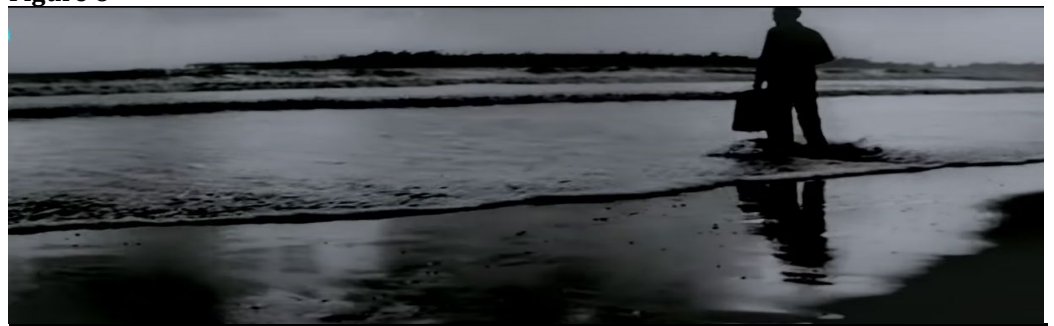
Figure 6 The Moment When Suresh is Labeled as an Unsuccessful Filmmaker Source Picture Captured While Actively Viewing the Film.