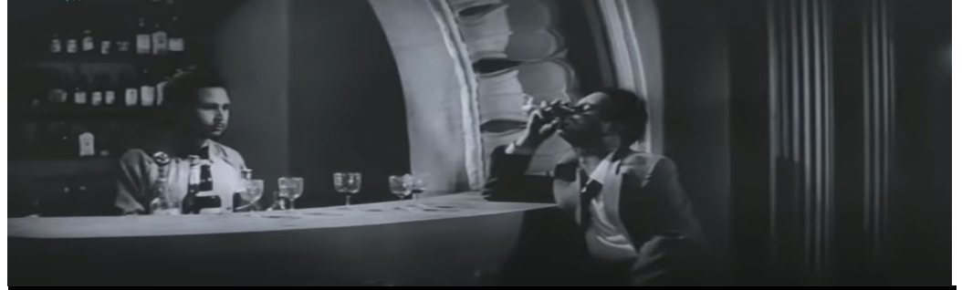
Figure 5 Scene Depicting Suresh (Guru Dutt) Repeatedly Requesting Whiskey, One After the Other Source Picture Captured While Actively Viewing the Film.