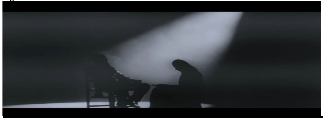
Figure 1 Dramatic Chiaroscuro Lighting in a Scene from 'Kaagaz Ke Phool'

Source Picture Captured While Actively Viewing the Film.