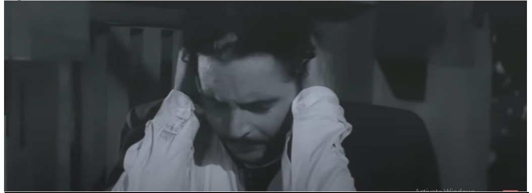
Figure 2 Guru Dutt as Suresh Distant "Pack-up" in a Scene from 'Kaagaz Ke Phool'.

Source Picture Captured While Actively Viewing the Film.