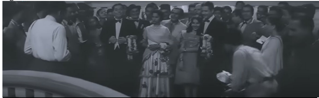
Figure 4 Moments following the Success of the Film Within 'Kaagaz Ke Phool'.