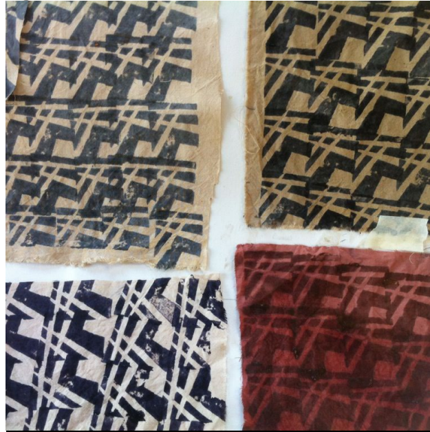
Figure 2 Block Printing Patterns (n.d.)