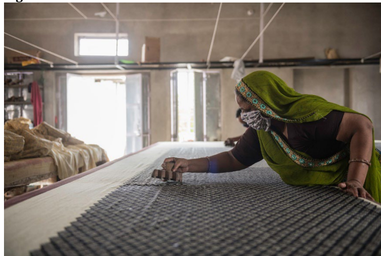
Figure 3 Preserving the Art of Natural Block Printing in Bagru, India Kothari (2020)