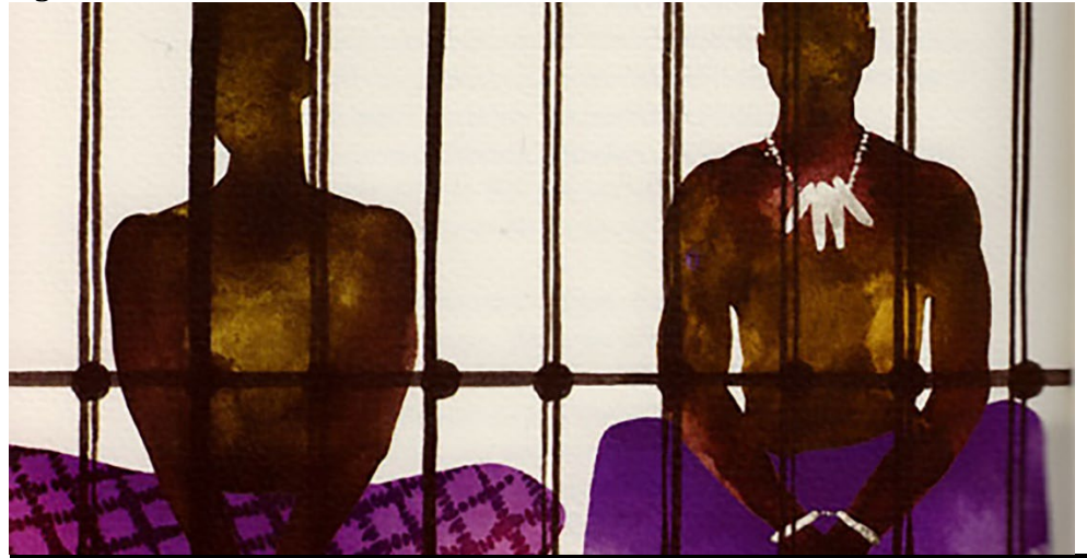
Figure 2 Role of the Novel in Discussing Society's Shortcomings

Ammu is another character who resists the oppressive structures of the caste system. Ammu, as a divorced woman, is considered a social outcast, restricted by the expectations imposed on her as a woman. However, she defies these expectations by seeking independence and pursuing a romantic relationship outside the boundaries of marriage. Through her actions, Ammu demonstrates agency and empowerment, refusing to conform to societal norms that seek to confine and marginalize her. Roy's portrayal of characters challenging social hierarchies emphasizes the potential for personal agency and the subversion of oppressive structures Mukherjee (2019) . It highlights the transformative power of individuals who dare to resist and disrupt the established social order, exposing the inherent flaws and injustices within it.