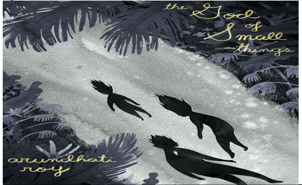
Figure 5 The Role of the Novel in Highlighting the Evils of the Society

The novel also explores the notion that resistance itself can be empowering, even in subtle ways. Characters like Estha and Rahel unintentionally become involved in acts of resistance through their encounter with Sophie Mol, an English girl visiting India. Their inadvertent participation in political dissent reveals the transformative potential of resistance, as even unintended acts can have far-reaching consequences, shaking the foundations of power and authority Kapoor (2015) . The acts of resistance undertaken by the characters not only provide a means of challenging oppressive structures but also enable personal growth, self-assertion, and the pursuit of a more just and equitable society. By resisting oppressive norms, the characters break free from the shackles of societal expectations and open up new possibilities for themselves and others.