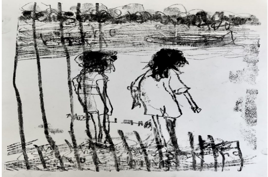
Figure 4 The Novel Displays the Discrimination of the Society

Over these characters' acts of defiance and self-assertion, Roy emphasizes the significance of individual autonomy and the right to shape one's own identity. By breaking free from social constraints, the characters not only forge their paths but also disrupt the power structures and norms that perpetuate oppression and marginalization. Roy's consideration of characters breaking free from social constraints prompts readers to question and challenge societal expectations that limit personal expression and growth Das (2016) . It serves as a reminder that individuality and self-determination are essential aspects of human existence and that the pursuit of personal liberation can lead to transformative change at both the individual and societal levels.