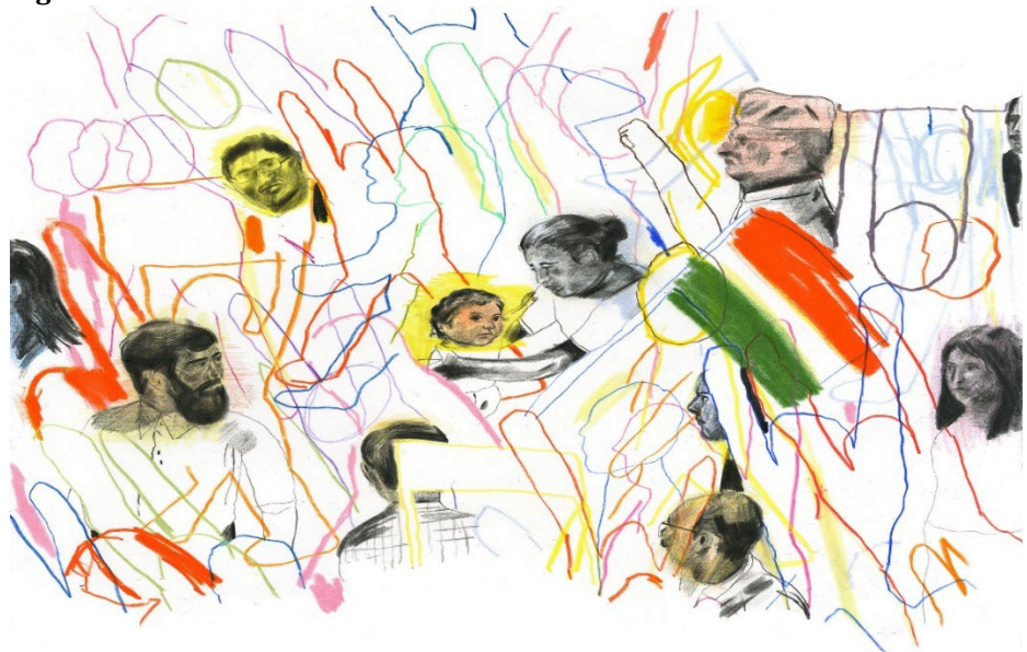
Figure 3 The Role of the Novel in Displaying India's Unity in Diversity

Their experiences shed light on the far-reaching consequences of political turmoil and the oppressive mechanisms employed by those in power. The depiction of characters confronting political oppression emphasizes the inherent risks and complexities involved in resisting oppressive regimes. It highlights the unpredictable ways in which political oppression can infiltrate personal lives and shape individual destinies. Through the characters' experiences, Roy demonstrates the need for resilience, courage, and a willingness to challenge the status quo in the face of political oppression Roy (2019).