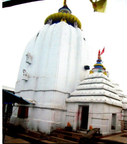
Figure 4 Vimana of the Dhavalesvara Temple of Dhavalesvara, Cuttack

Shivalinga of sanctum is dedicated to Lord Dhavalesvara Shiva. Outsiders cannot see Shivalinga in this location. Above the sanctum is a brass serpent sculpture. Over the Saktipitha , a four-pillared kanaka mandapa of the modern period was constructed to safeguard the Shivalinga. The sanctum's floor is located 6 feet lower than the temple surface. The sanctum's inside walls are covered in marbles. Steps of ascending order are erected for entry into the sanctum-sanatorium. There is only one door leading to Jagamohana in the sanctum. At either side of the pidha mundi recesses of the doorway, Nandi and Bhrunji figurines are carved. They are assuming the role of the temple's dvarapalas . On the wall above the doorway lintel is a Navagraha panel. All nine gods ( Grahas ) are seen in yogasana with their hands holding as usual attributes. The entryway lintel's middle is decorated with a carving of the goddess Gaja-Lakshmi.