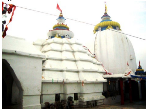
Figure 1 Dhavalesvara Temple of Dhavalesvara, Cuttack District, Odisha