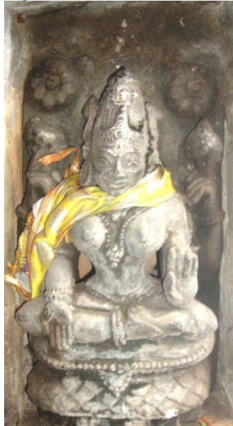
Figure 8 Vaishnavi Image of Dhavalesvara Temple of Dhavalesvara, Cuttack