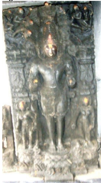
Figure 9 Ananta Basudeva Image of Dhavalesvara Temple, Dhavalesvara