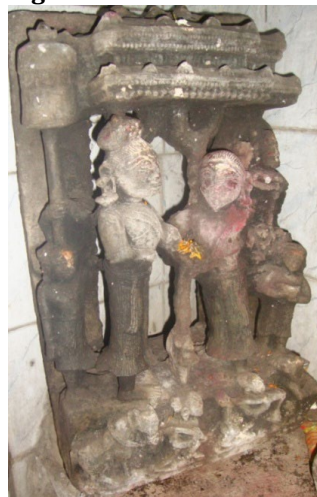
Figure 5 Radha-Krishna Image of Dhavalesvara Temple of Dhavalesvara, Cuttack