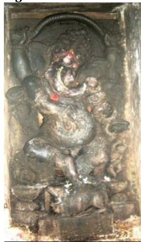
Figure 2 Ganesha Image, Parsvadevata of the Dhavalesvara Temple

The eastern side's parsvadevata is Kartikeya. In the study of Odishan iconography and art tradition, the six-armed, three-headed representation of Kartikeya of the site is unique Donaldson (1985/86), p. 38. Kartikeya's likeness is carved in a standing position on top of a peacock figure that is positioned on a pedestal with two petals of the lotus flower. He is holding a small spear in his right hand. The elbow section of one of the right hands is broken, while another right hand