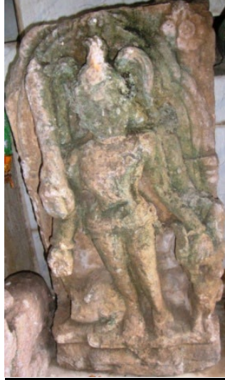
Figure 7 Old Kartikeya Image of Dhavalesvara Temple of Dhavalesvara, Cuttack

Vaishnavi: On the triple-sectional pedestal, a Vaishnavi figure is engraved in the yoga pose. She makes the mudras for sankha in the upper left arm, chakra in uppara right hand, abhaya mudra in the lower left arm, and varada mudra in the lower right hand. She has designed mukuta on her head and wears earrings. On the upper corner of the slab is a depiction of a full-blown lotus blossom. Chlorite stone was used to create the image of Vaishnavi. It is 1 foot 6 inches tall and has a width of 10 inches. The 16th century CE may be assignable to the date of Vaishnavi image.