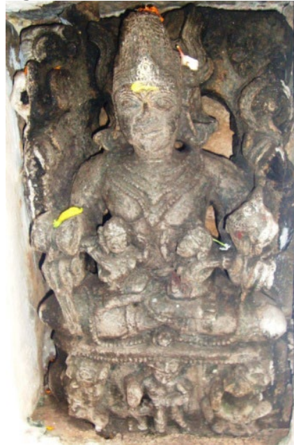
Figure 11 Hari-Hara Image of Dhavalesvara Temple, Dhavalesvara, Cuttack

A Couple Figure: A stone couple figure is found installed in one of the niches of western outer wall of the jagamohana and it is approximately 1 ½ feet high.