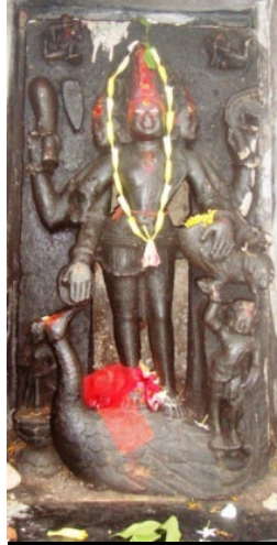
Figure 3 Kartikeya Image, Parsvadevata of the Dhavalesvara Temple, Dhavalesvara

Goddess Durga is the northern side parsvadevata of the temple and it is worshipped by local people as Goddess Parvati. So, it is a peculiar thing of the Dhavalesvara temple. Her roots appear to be among the tribal and peasant cultures of India. Durga is an established Goddess in mediaeval Hinduism, upholding dharma like a female version of Vishnu and defending the cosmos from the menace of demons Kinsley (1986), p.96. On the pedestal, there is a standing carving of Durga with eight arms. On the pedestal of the slab, there is a statue of Mahisasura. The Puranas record an intriguing struggle between Mahisasura and Durga and the eventual slaying of the latter with his friends Das (1997), p. 246. The devi Durga slab is where this killing scene is shown. The goddess Durga's hands have all been broken. According to the temple priests and the locals, Kalapahara a Muslim invader who raided temples in Odisha during the Middle Ages broke this image. Black chlorite stone is used to create the image of the goddess Durga. The author was unable to document Devi Durga's iconography in detail, because of restrictions and being completely covered by clothing. The image of Durga is 2 feet 11 inches in height and 1 foot 9 inches in width. It shows the artistic features of the mediaeval period of Odishan history. Devi Parvati/Durga is placed in 20 feet high pidha temple/shrine.