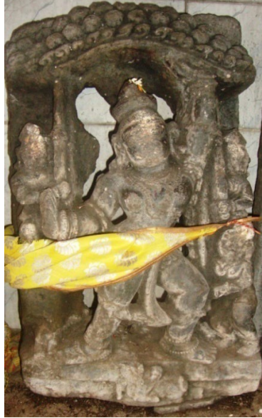
Figure 6 Lord Krishna is Lifting the Govardhan Mountain is Noticed in the Southern Side of the Dhavalesvara Temple , Dhavalesvara

Vishnu: Carved into the double-petalled pedestal is a four-armed representation of Lord Vishnu in the padmasana pose. He is holding sankha in his upper left hand, padma in his upper right hand, and chakra in his lower left hand. The lower right hand is fractured at the elbow. A kirita mukuta is placed on the deity's head. On both sides of the pedestal, there are images of devotees holding folded hands. On Lord Vishnu's thigh, there is a little statue of Lakshmi (?). Chlorite stone is used to create the image of Lord Vishnu. Its width is 11 inches, and its height is 1 foot 7 inches. The Vishnu image's aesthetic reveals the 15th century Odishan art's artistic characteristics.