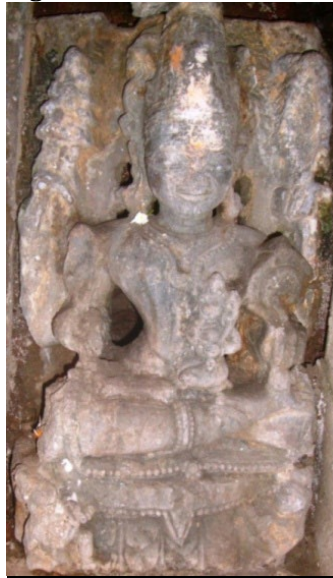
Figure 10 Vishnu Image of Dhavalesvara Temple of Dhavalesvara, Cuttack

Rama: A statue of Lord Rama has been kept on the site's Navagraha slab. On the double sectional pedestal, a two-handed image of Lord Rama is engraved in a standing position. He is seen as an archer. The right hand is severed from the elbow part whereas the left hand retains the bow. The god slab is entirely unadorned. It is made in chlorite stone. It stands 1 foot 7 inches tall and has a width of 9 inches. The artistic characteristics of the mediaeval classical Odishan art are seen in the iconographic elements of the Rama figure.