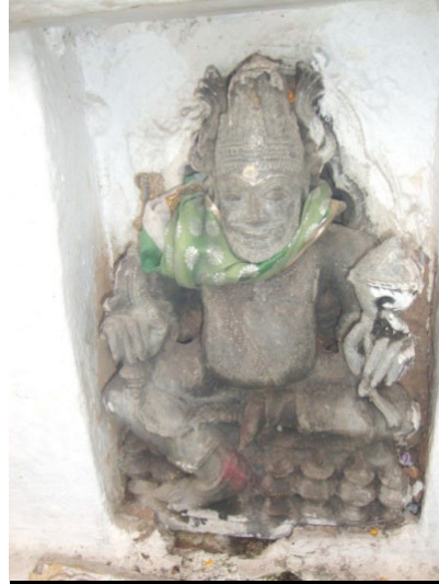
Figure 12 Brahma Image of Dhavalesvara Temple of Dhavalesvara, Cuttack

Bedhakali image is found to be worshipped at the niche of southern outer wall of the jagamohana .