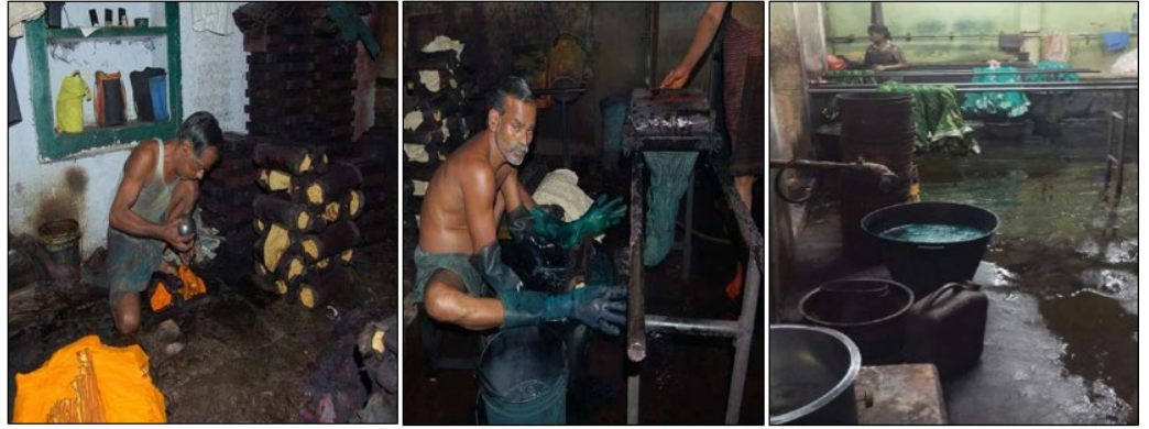
Figure 4 The Contemporary Method-Batik Dyeing with Chemical Dyes