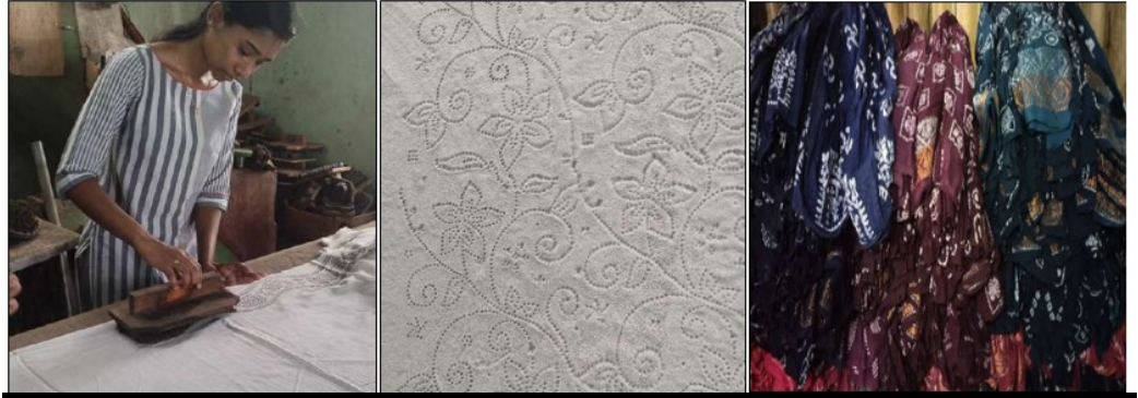
Figure 6 The Similarity Between Bandhani and Sungudi in Using Dots