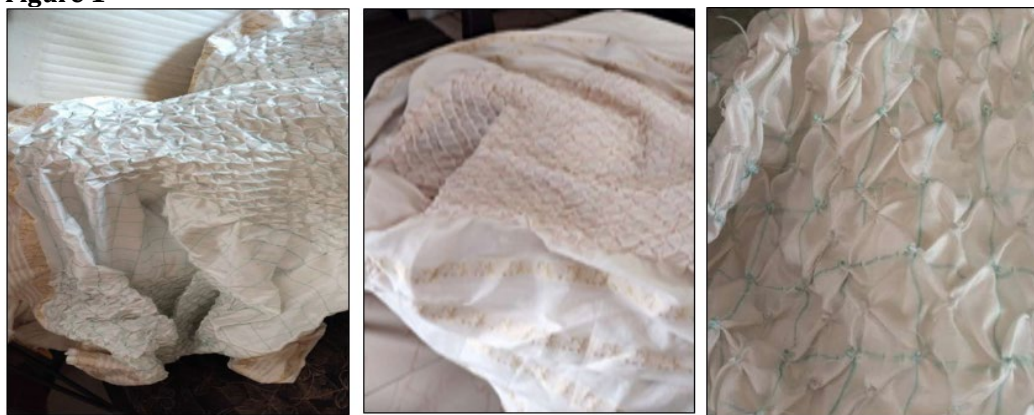
Figure 1 Each Saree Would Have 10,000 to 21,000 Dots and Take 15 Days to Create