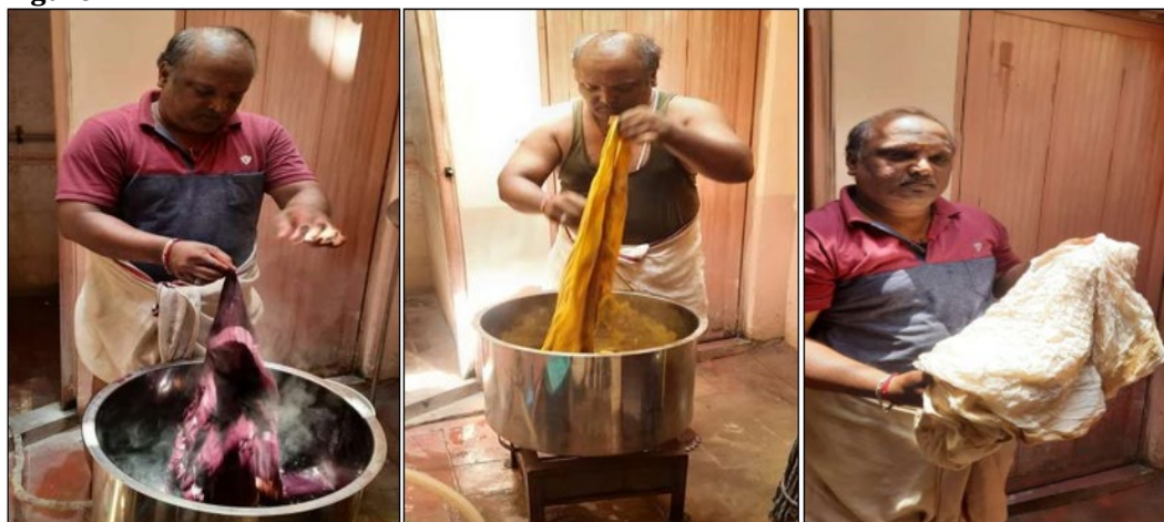
Figure 2 Boiling the Knotted Fabric in a Boiling Dye Bath for 15 to 20min for the Dye to Stick to the Saree, Ootucharam a Naturally Available Fixative is Used for Colour Fixation, and the Fabric is Dried in the Shade for 1 Day.