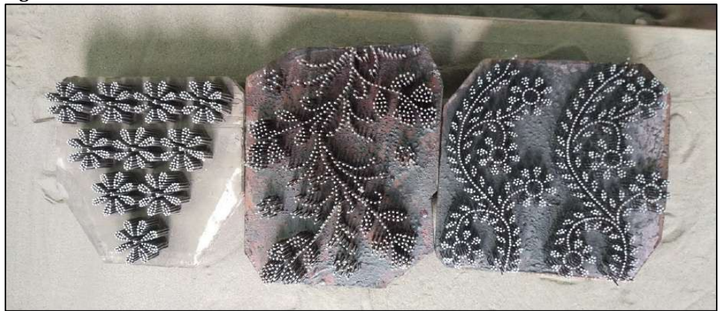
Figure 5 Contemporary Motifs for the Batik Method of Sugudi Saree Preparation

and wearing, while also showcasing a vibrant range of colors. Comfortable and vibrant, Sungudi sarees truly encapsulate the essence of timeless style. The Sungudi print saris are very lightweight and comfortable to wear. By the 80s, the original art of hand tie and dye was slowly disappearing from Tamil Nadu as manufacturers began switching to chemical dyes, block prints, and power looms.