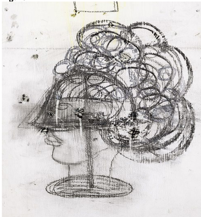
Figure 4 Juloos and Other Stories, Digital Prints: Erased Drawings On Board