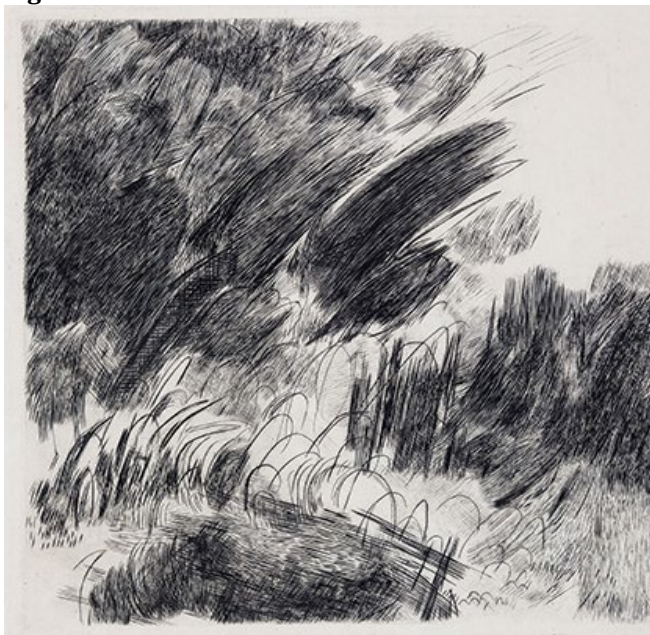
Figure 2 Untitled, Engraving, 1978-88