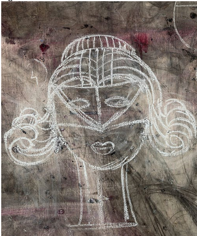
Figure 3 Juloos and Other Stories, Digital Prints: Erased Drawings On Board