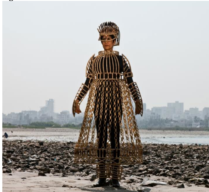
Figure 5 Of Bodies Armour and Cages, Photo Performance (2010-12) Digital Print on Rag Paper

We can see the adaptation of technologies has significant impact on artistic practices. By engaging with computing on variety of levels as medium using it as tool, as iconography artist find her ways into the domain of print making. For Shakuntala, the conceptual implications of digital technology inspire ideas. Here she establishes use of the matrix (color choices, scale, limitations and distribution) which functions as a translator of artist generated or defined information whether photographic image or data sets.