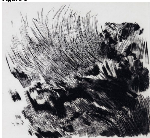
Figure 1 Untitled, Engraving, 1978-88