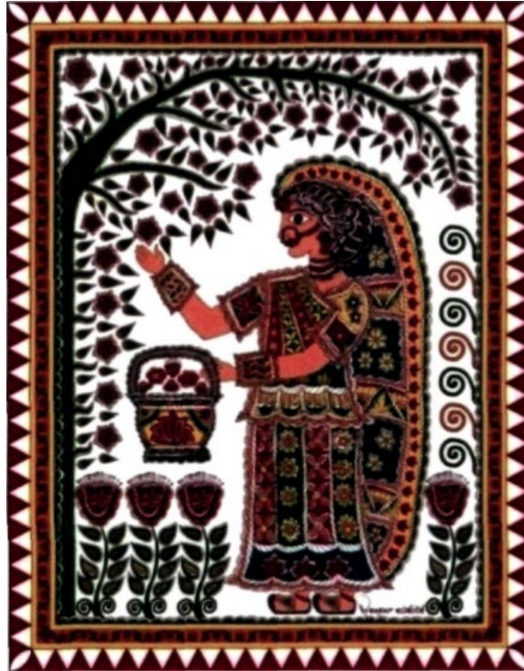
Figure 7 Women Plucking Flower, Madhubani Painting on Paper.