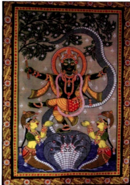
Figure 5 Patachitra of Odisha, Kaliya Demon.