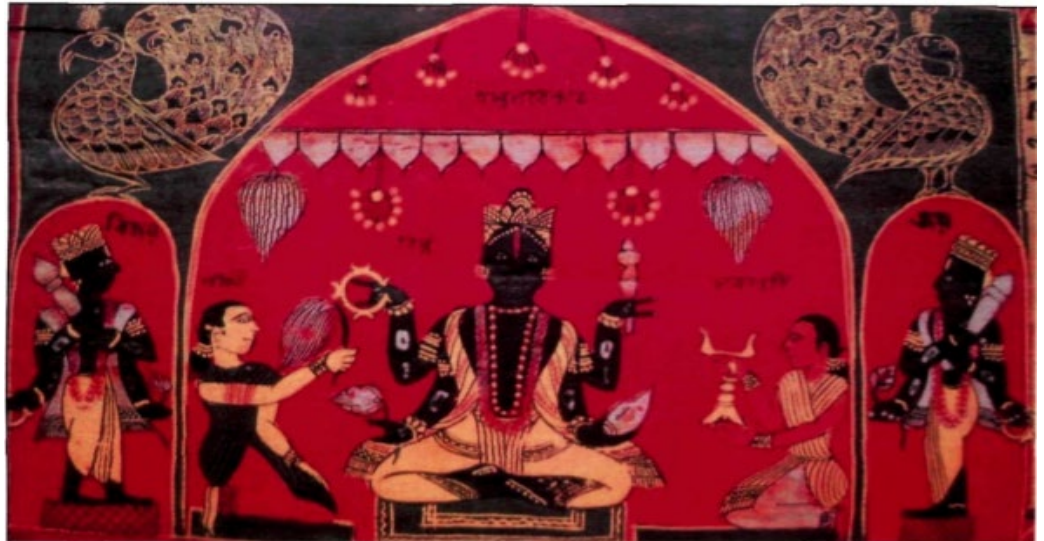
Figure 9 Vishnu in Vaikuntha (Heaven), Kirtana Manuscript.