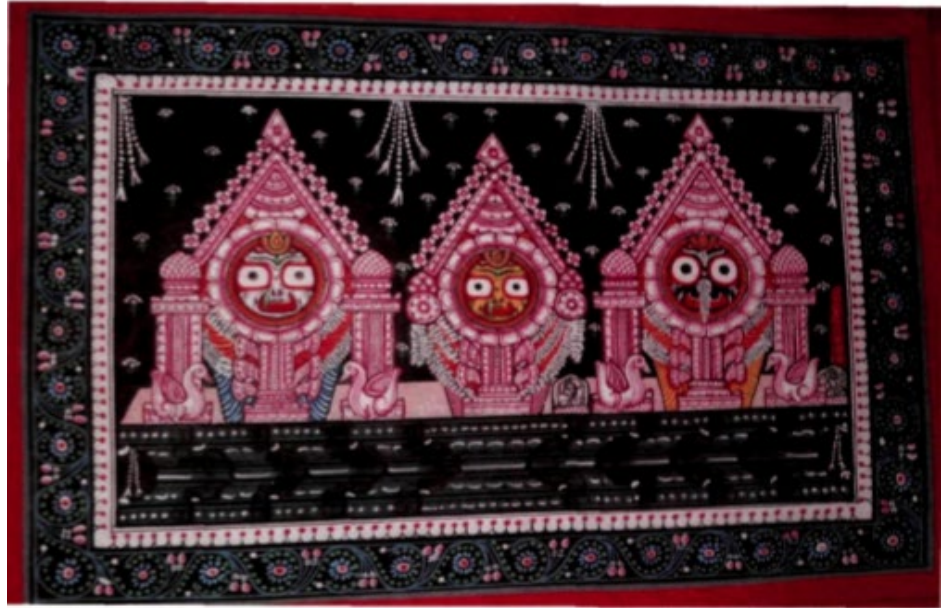
Figure 4 Patachitra Painting of Odisha, Lord Jagannath, Balaram and Subhadra.