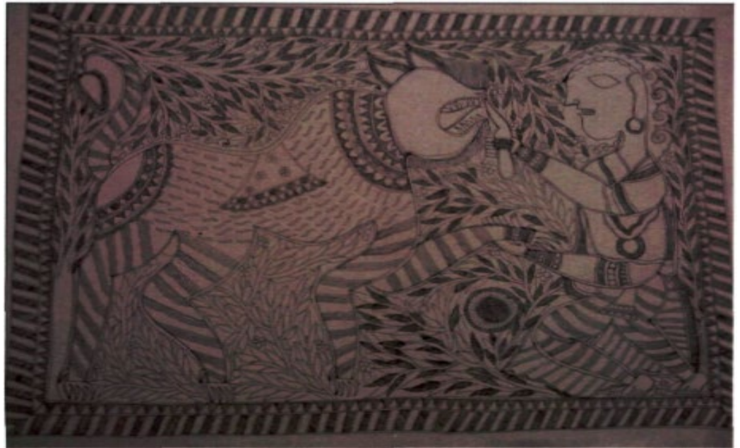
Figure 6 Godna Painting of Bihar, Ink on Paper.