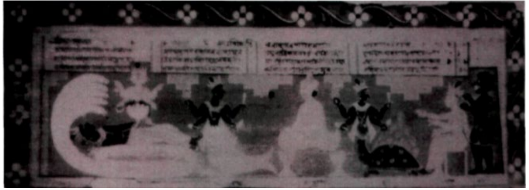
Figure 8 Folio from Kirtana Manuscript.