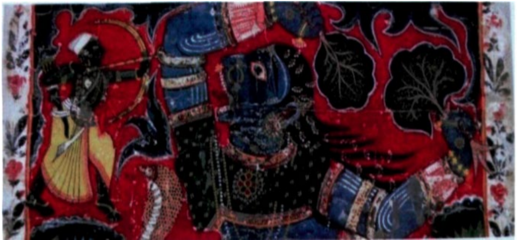
Figure 3 Rama Kills the Demon Taraka, Ramayana Pat, Gouache on Paper, Murshidabad, West Bengal.