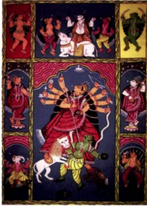
Figure 2 Durga, Patachitra of Bengal.