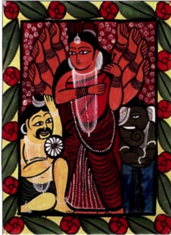
Figure 1 Durga, Patachitra of Bengal.