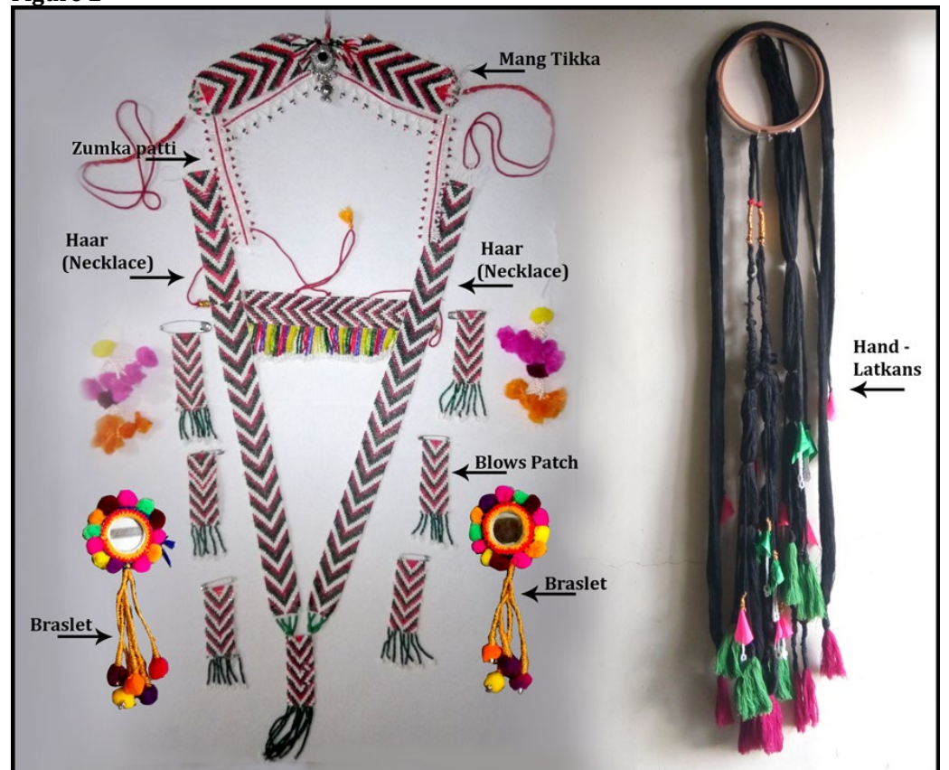
Figure 2 Kalbeliya Jewellery