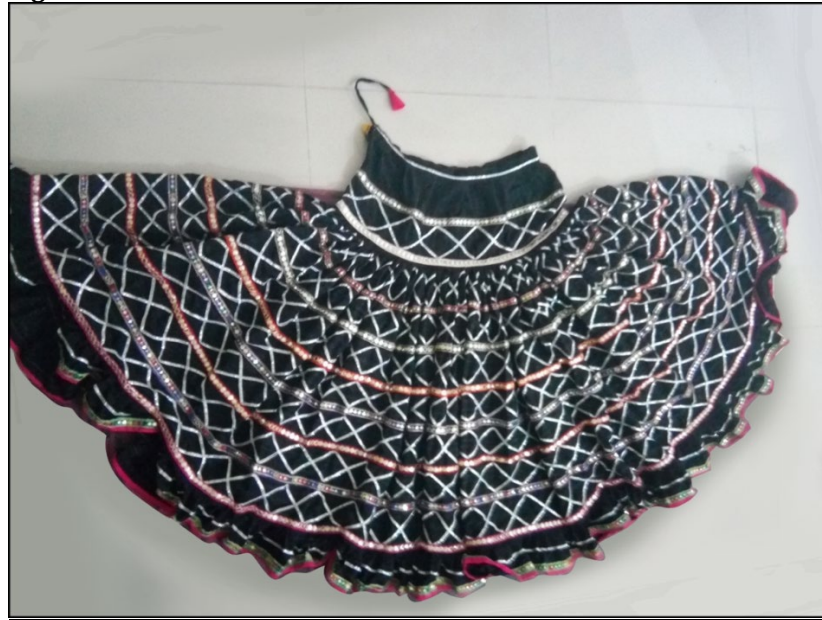
Figure 3 Kalbeliya Costume Lehenga