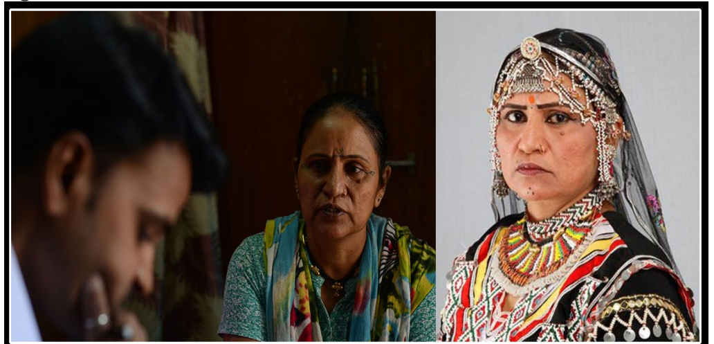
Figure 1 Meeting with Padmashri Dr. Gulabo Sapera