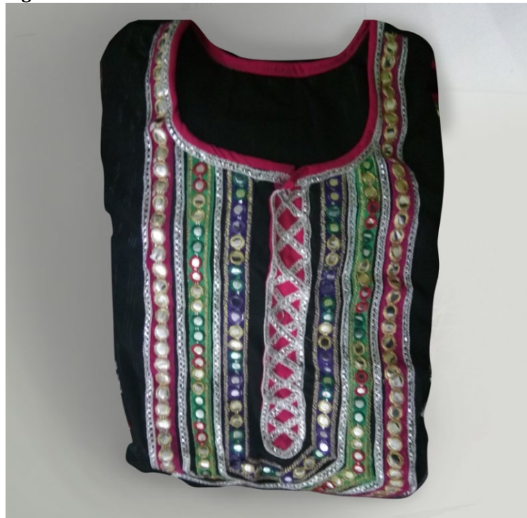
Figure 4 Kalbeliya Costume Angrakhi