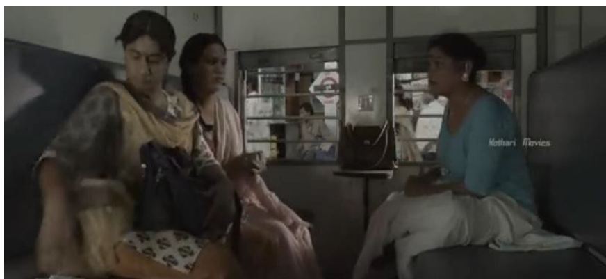
Figure 2 Dannamma Accompanies Vidya and Selvi to their Nirvana Naanu Avanalla Avalu (2015), 1:25:42