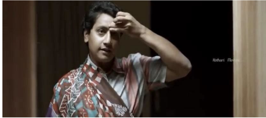
Figure 6 Madhesh Draping a Saree Naanu Avanalla Avalu (2015) , 0:34:49

For depicting self-love, the paper has particularly examined the shots of 'looking oneself in the mirror' as in the Figure 3 , Figure 4 , Figure 5 and Figure 6 , which is a powerful and complex moment of self-discovery and self-love. A mirror can symbolize self-acceptance, where they find themselves in the mirror as their true selves, and as self-doubt, where they find the challenges of transitioning in a society that may not fully understand and accept them. The use of mirrors can be a powerful and poignant way to explore the complex emotions and experiences of trans individuals.