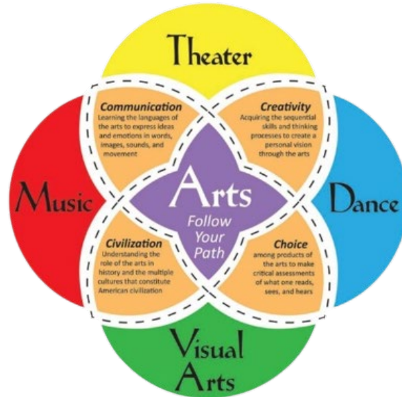
Figure 1 Arts Follow Your Path