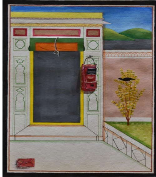
Figure 7 "Crow's Augury", 11.5x15.3cm, Acrylic & Sketch Pens on Handmade Paper, 2021

Interestingly, in the current scenario with the change in technology and time, these letterboxes are now covered with dust and sand. This brings the observer to the question as to why these boxes in this time are depicted in the painting. These boxes have now become a symbol of nostalgia and give us a sense of the time when we are not so much developed and hung onto technology. In the current times, things have changed and evolved, letterboxes have been replaced by social media, and if we have to give a message or share things with someone, we can easily do Whatsapp or e-mails, etc. The artist was originally from Kurawali, Uttar Pradesh which is a plain area and then he migrated for studies in the hilly area. The change in space is the source of inspiration for this painting. The letterbox in these times has become a useless entity and its presence plays the role of satire in the contemporary era. The artist has also tried to emphasize the metaphysical state of mundane objects. In the older days when people used to go to work and study the only method to stay in touch with family and friends was to convey their messages through letters. The concept of personification is well described through these letterboxes as now they are old, and the fading of their colour talks about their survival and existence.