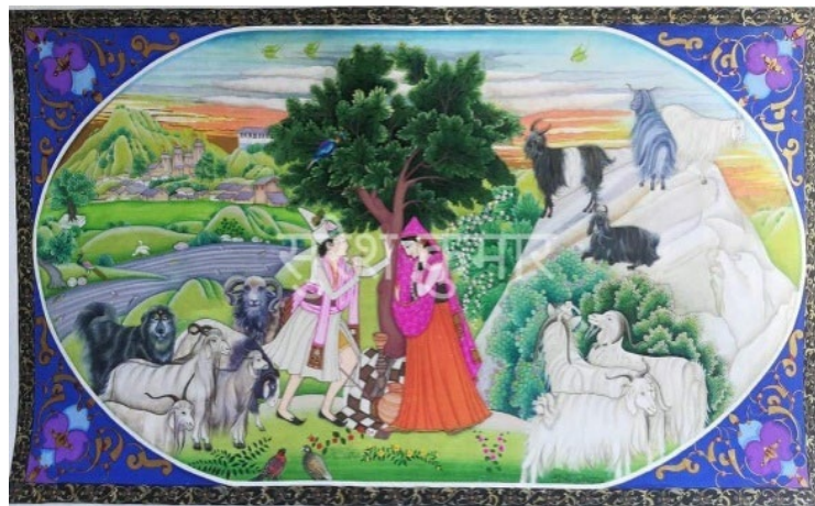
Figure 3 Kunju Chanchalo-I, Acrylic on Paper ,22x30", 2020

On the left side, we can see River Ravi painted in grey colour in which the image of fishes is made beautifully. In this Pahari miniature, the story of Kunju leaving for war is painted where he has presented the artist painted a gift in the form of a silver button that is given as a memorial to Chanchalo Kumar, S. Interview, (2022) . Here, Chanchalo can be seen in traditional dress-Chola-Dora Banerjee (1994) (traditional dress Worn by men of the Gaddi tribe in Himachal Pradesh, 'Chola' is a long woollen coat that covers the knees. Dora is usually multi/ black in colour paired with Chola) and Kunju draped in the traditional Chola Dora, wearing a hat with peacock feathers. Besides that, the Jhunju Rana bird and grey francolin are also depicted in the foreground. The wise choice of colours; white, orange, and blue in the sky blend