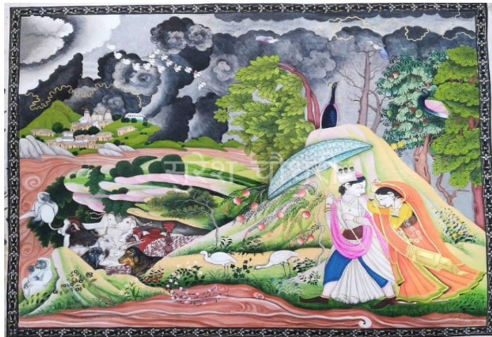
Figure 4 Khunju Chanchalo-II, 12x16", Tempera Vasli

The observer can see the mother and child of Baboon hiding from the pangs of the storm. Behind the couple, four beautiful trees are painted in which the mango one is shown to have abundant fruits loaded on itself. The intricately rendered miniature painting is composed of a lovely landscape of lush green flora and folk hutments portraying the tranquil beauty of Himachal Pradesh Kumar, S. Interview, (2022) . In some Pahari miniature paintings, the peacock believed the role of lover or the hero. With nightfall, even the peacock retreat into the groves to enjoy the companionship of their beloveds. The dark night outside and the strong storm within amplify the strong emotional feeling of separation Lavanya (2019) . The blazes of lightening in the dark cloudy sky signify union Dehejja (2002) .