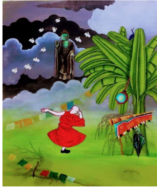
Figure 1 Blessing of Buddha, 4x6', Acrylic on Canvas,2021