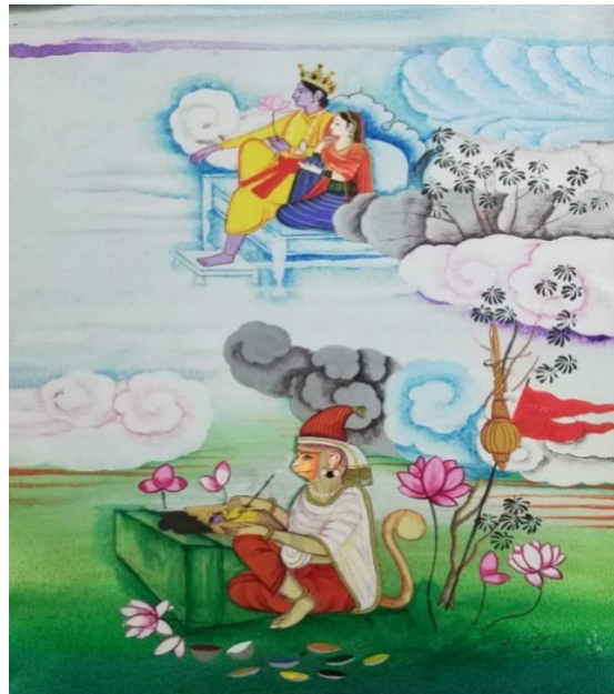
Figure 6 Hanuman Making the Portrait of Ram-Sita, 1.5x2.25', Acrylic on Canvas, 2021