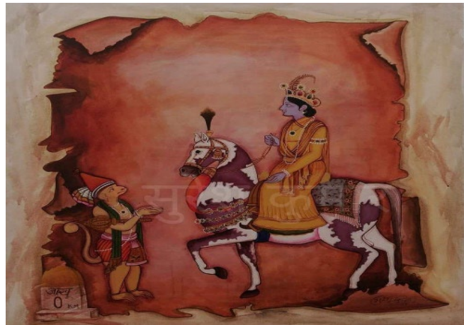
Figure 5 Ram's Arrival at Jakhu, 2.5x2.5', Acrylic on Canvas, 2020

In this painting ( Figure 6 ), Rama-Sita is shown sitting on the throne. In this miniature, the use of blue and white colour represents and symbolizes peace and calmness. All three figures are painted in profile, in which Lord Hanuman is shown making the portrait of Lord Ram and Sita. The blooming of lotus on the ground and shrubs on clouds gives this painting a surrealistic approach that revolutionizes human experience that maintains a balance in a rational vision that asserts the power of the unconscious and thoughts. In this painting, one can easily see that the artist elaborates on fantastical spaces or dream-like that could never be possible in reality. It is an attempt to articulate what occurs deep in a person's brain. The colour scheme of the painting is similar to Kangra miniature paintings. Even the trees, plants, faces of figures, flowers, and clouds are in realistic and lifelike approach, focusing heavily on nature. The colors used in the making of the Kangra paintings are made out of vegetable extracts and other naturally made substances. Kangra artists rarely use artificial colors in their paintings. The colors red, yellow, and green