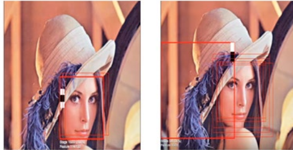
Fig. 1. Face Detection.

The advantage over the existing system is, elimination of use of hardware and also saves time and is not prone to human error.