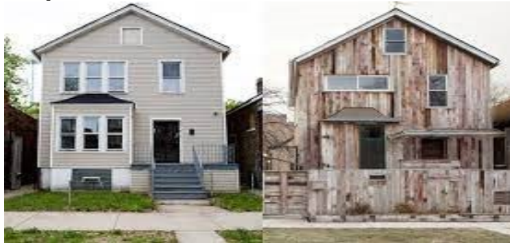
Image of before and after-Gates' 2009 project Dorchester Projects is an investment of an abandoned 2 story property that has been recycled and turned into a Library, Slide Archive and Soul Food Kitchen (Esmaamohamoud).