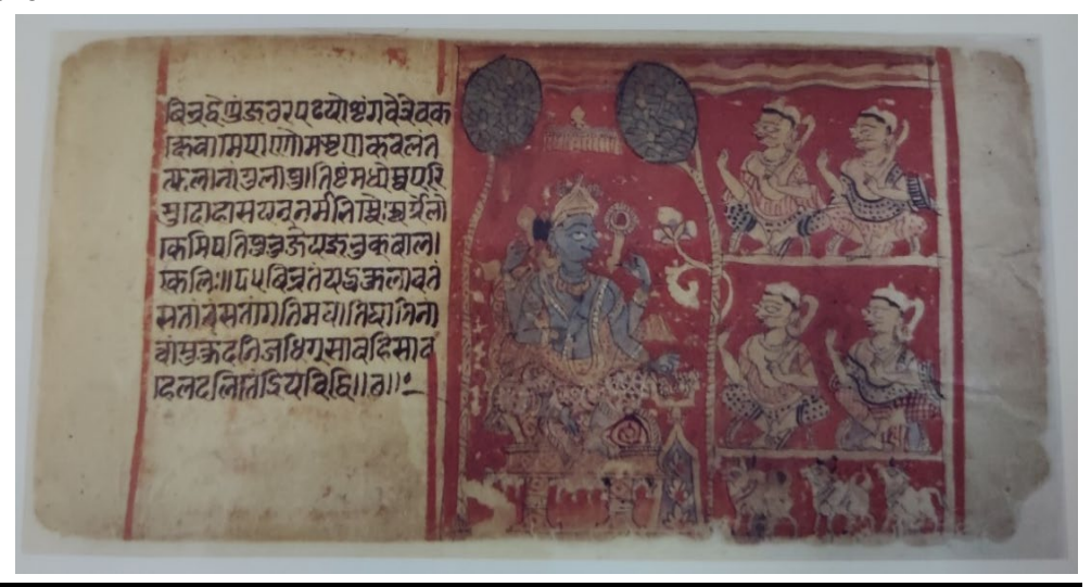
Figure 1 A folio from Bal-Gopal-Stuti .

The Figure 2 depicts Krishna taking cows to the forest for grazing. The nine cows are drawn in three vertical rows and a variety of trees denotes a thick jungle. Krishna is shown with his flute and a stick. He is depicted in blue colour wearing a Pitamber , which is a common depiction for him. He is wearing a peacock feathered crown and is also adorned by jewels around his neck, wrist, and ankles. He is wearing armlets and Kundals . Folk motifs fill up the spaces and the textiles also have the folk motifs thus creating a sense of harmony with the repetitive depiction. The red background pulsates with energy. Big protruding eyes, three fourth face profiles show the influence of Western Indian style of paintings.