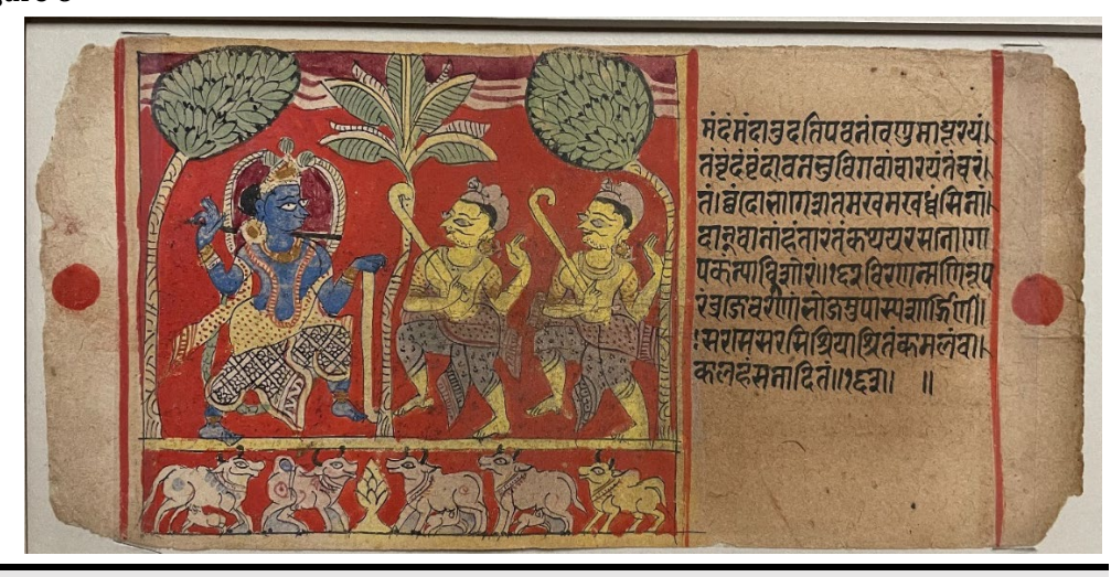
Figure 6 A folio from Bal-Gopal-Stuti . Source Museum of Fine Arts, Boston