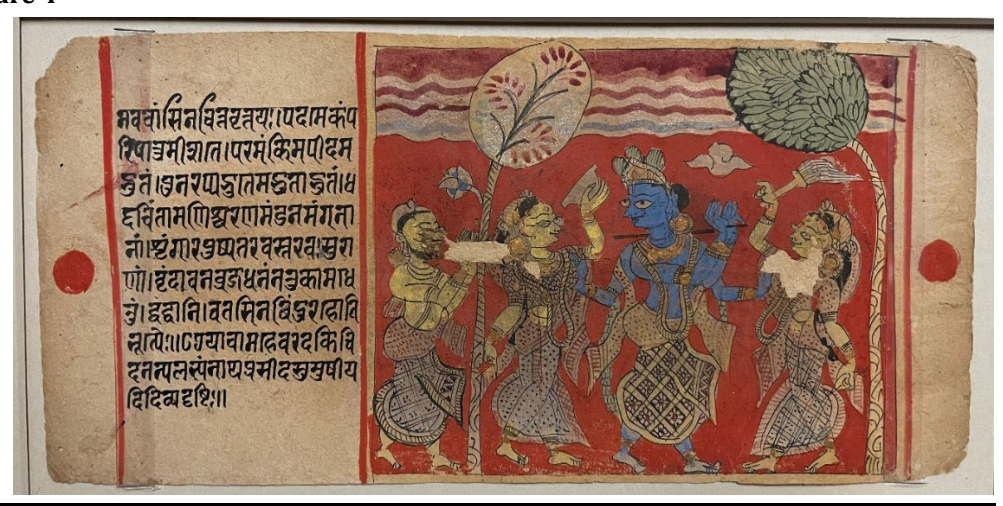
Figure 4 A folio from Bal-Gopal-Stuti .