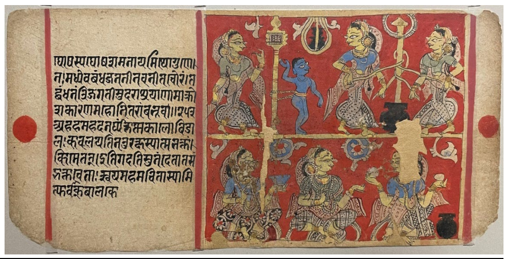
Figure 5 A folio from Bal-Gopal-Stuti .