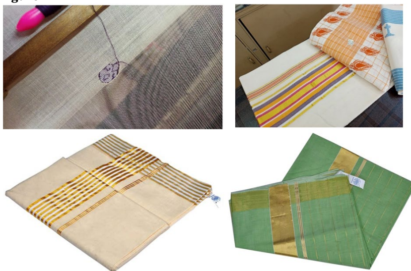
Figure 4 Designs & Motifs

Natural dyes were employed in traditional Chendamangalam sarees to create primary colours like blue, yellow, and red, particularly on the borders and body. The traditional set mundu garment had pure gold borders. Modern renditions, on the other hand, use a wider range of colours, including artificial dyes like Vat dyes, which provide vivid hues like maroon, grey, pink, and violet. These sarees retain the puliyilakara border, which is a thin black line along the selvedge, and frequently contain contrasting colour combinations, such as checks of green and violet. The