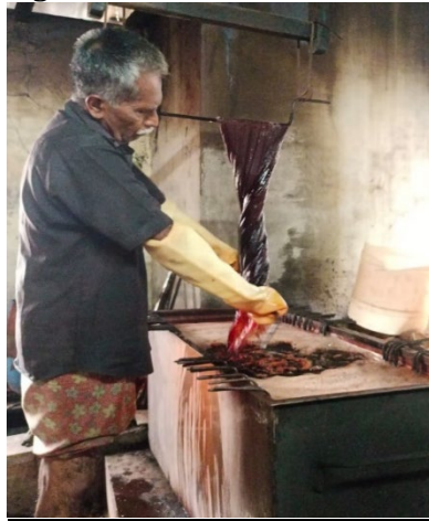
Figure 1 Yarn Dyeing