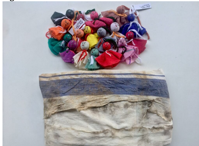
Figure 5 Chekutty Dolls Menon (2024)