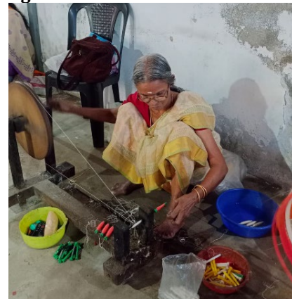
Figure 2 Hand Spinning of Yarn