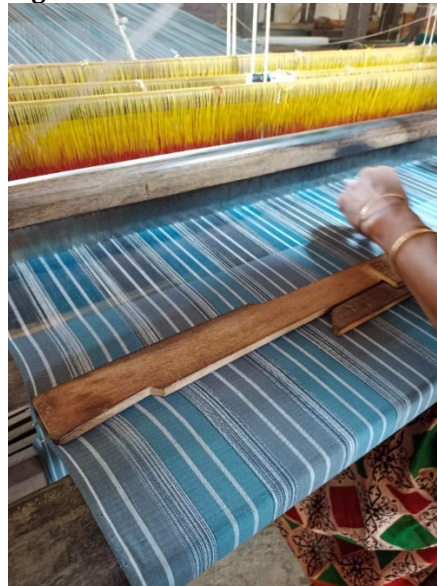
Figure 3 Weaving

Fine-count thread is a distinguishing feature of Chennamangalam sarees and textiles, signifying their superior quality. Usually, yarn counts of 120, 100, and 80 are used; however, in this case, a finer count of 2/120 is used. Making a saree with this yarn takes about two weeks total, but it might take longer depending on how intricate the design is.