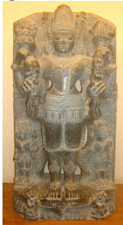
Figure 8 The Vishnu Image of Bhubaneswar of the Khordha District, Odisha Circa 13th Century CE