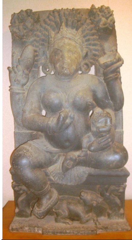
Figure 4 The Varahi Image of Dharmasala of the Jajpur District, Odisha Circa 9th Century CE The Photograph of Varahi Image of Dharmasala of the Jajpur District was Taken by the Author from the Odisha State Museum