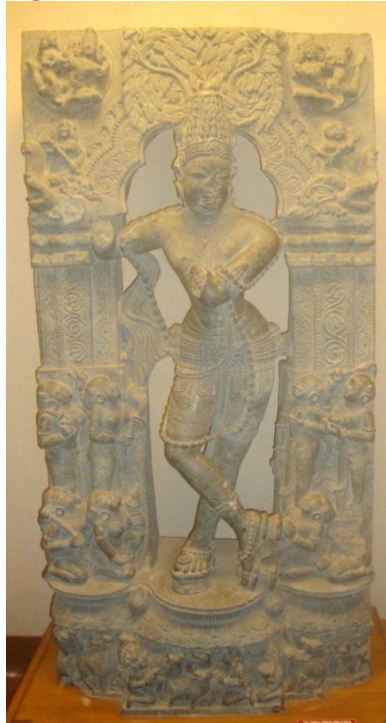
Figure 10 The Gopinatha Image of Bhingarpur of Khordha District, Odisha Circa 13th Century CE The Photograph of Gopinatha Image of Bhingarpur of the Khordha District was Taken by the Author from the Odisha State Museum of Bhubaneswar.