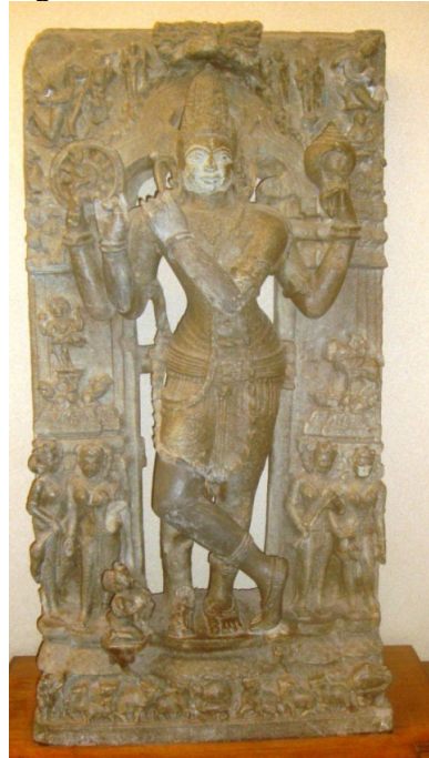
Figure 6 The Krisna-Vishnu Image of Dharmasala of the Jajpur District Circa 12th Century CE