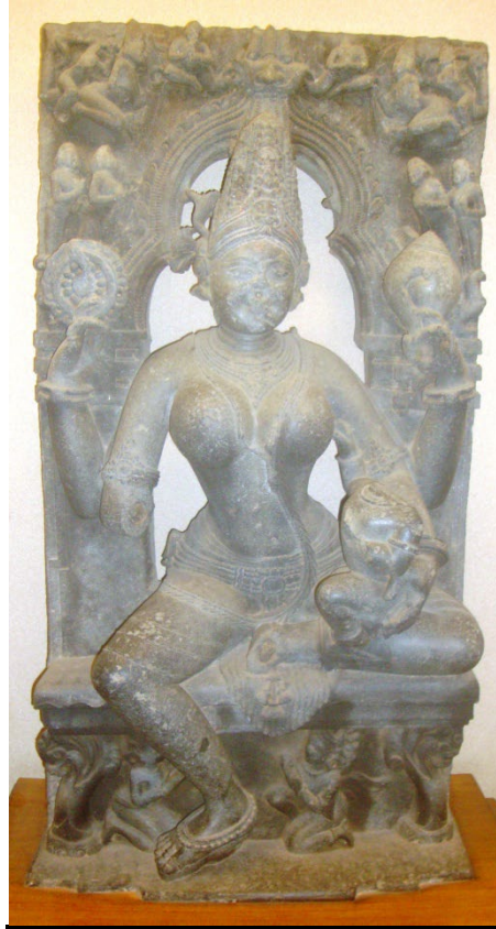
Figure 2 The Vaishnavi Image of Dharmasala of the Jajpur District, Odisha Circa 10th Century CE