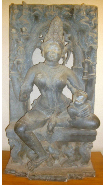
Figure 1 The Indrani Image of Dharmasala of the Jajpur District, Odisha Circa 9th Century CE