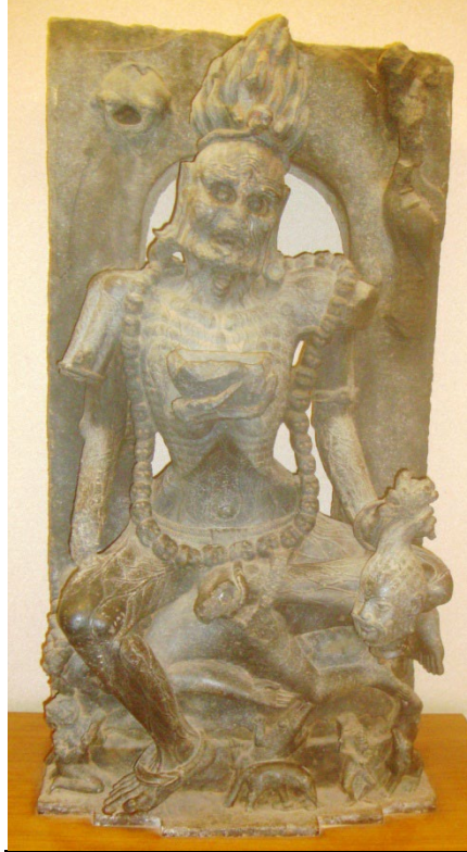
Figure 3 The Chamunda Image of Dharmasala of the Jajpur District, Odisha Circa 9th Century CE