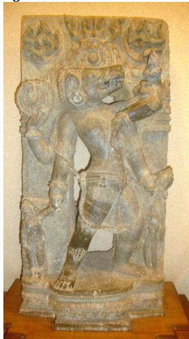
Figure 7 The Varaha Image of Dharmasala of the Jajpur District, Odisha Circa 12th Century CE