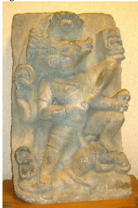
Figure 9 The Varaha Image of Khichingi of Mayurbhanj District, Odisha Circa 10th Century CE The Photograph of Varaha Image of Khichingi of the Mayurbhanj District was Taken by the Author from the Odisha State Museum of Bhubaneswar