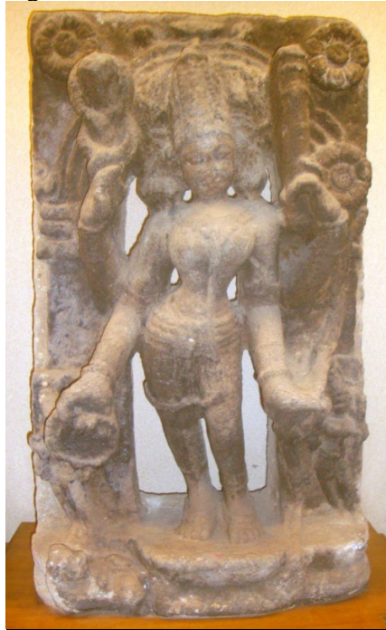
Figure 5 The Parvati Image of Bhubaneswar of the Khordha District, Odisha Circa 9th Century CE The Photograph of Parvati Image of Bhubaneswar of the Khordha District was Taken by the Author from the Odisha State Museum.